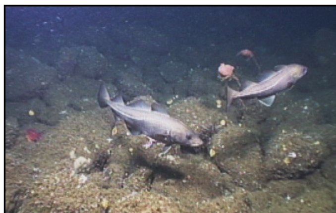
Haddock (top) and cod (bottom) use boulders for protection from prey. Georges Bank.