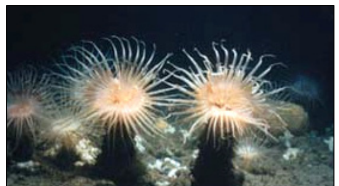
Top: NURP research sites. Map: USGS. Center and Bottom: Starfish and anemone provide complex habitat for fish, Stellwagen Bank.