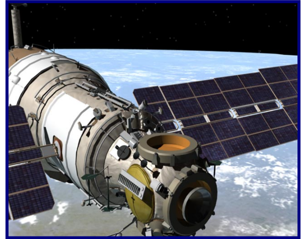
Zvezda, the International Space Station module where astronauts live and work. .

The mission control base on Key Largo supports missions with 24-hour video, audio and life-support systems monitoring. NEEMO missions host live-links with the ISS and the Johnson Space Center's Exploration Planning and Operations Center (ExPOC) control room, simulating the interaction between astronaut and control room on space flights.