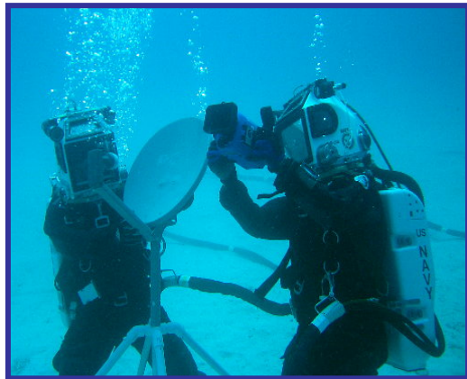
Testing the ability to manipulate equipment while wearing EX-14 system diving suits.