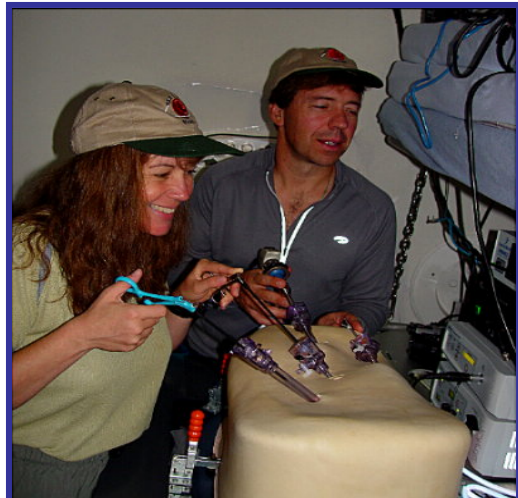
Astronauts simulating gall bladder removal onboard Aquarius .