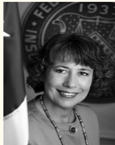
Chairman Sheila C. Bair Federal Deposit Insurance Corporation

I have long supported a systematic and streamlined approach to loan modifications that puts borrowers into affordable, long-term mortgages while achieving an improved return for bankers and investors compared to foreclosure. Using this type of approach, we can help stabilize the U.S. financial markets by minimizing foreclosures on the 6.4 million loans that are currently past due or are projected to become delinquent by mid-2010. Avoiding foreclosure, when it is financially prudent to do so, reduces the downward pressure on the price of nearby homes and helps communities to maintain the services they provide to neighborhoods. Unnecessary foreclosures perpetuate the cycle of financial distress and risk aversion, which potentially could cause housing prices to overcorrect and create even larger losses for both borrowers and the financial industry.