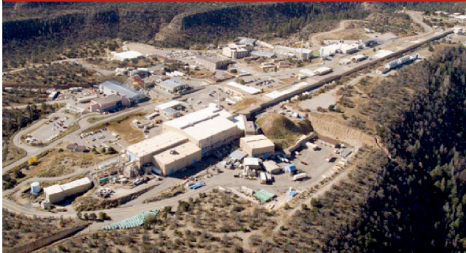
IPF is located at the Los Alamos Neutron Science Center