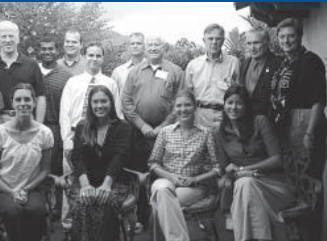
Rep. Kolbe and a congressional delegation visit with Peace Corps Volunteers in Guatemala.