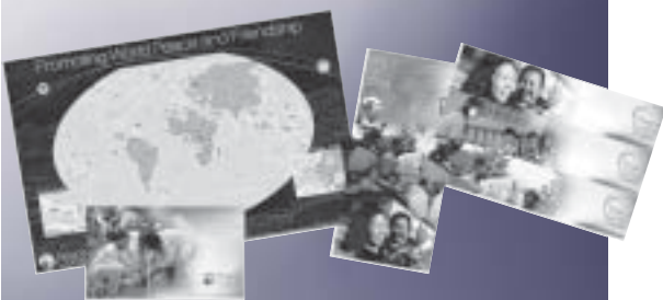
Peace Corps Week 2004 presentation kit materials