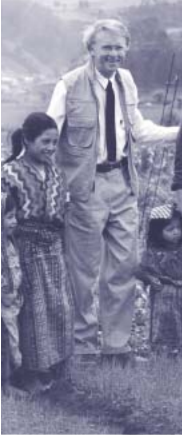
Above, Paul Coverdell in Guatemala.

The Paul D. Coverdell Award for Excellence pays tribute to educators who have helped students achieve greater cross-cultural understanding through resources of the Paul D. Coverdell World Wise Schools program. The World Wise Schools program was established by the late Senator Paul D. Coverdell, who was Peace Corps director in 1989, and it was named in his honor by the U.S. Senate in 2001.