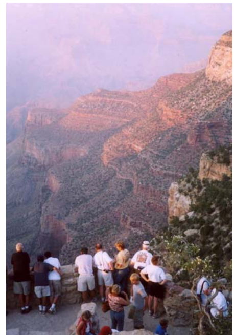
Grand Canyon National Park

Social Science Program National Park Service 1849 C Street NW (2300) Washington, DC 20240