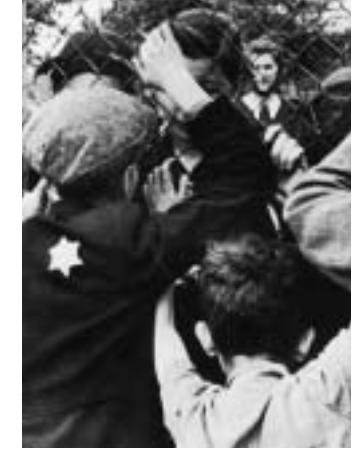
TO THE CAMP (#5)

Two young boys stand in the fenced yard of the Central Prison, the primary assembly point for deportees from the Lodz ghetto. From here, children under ten years of age, the elderly, and the infirm were deported to the Chelmno killing center, where they were murdered in September 1942.