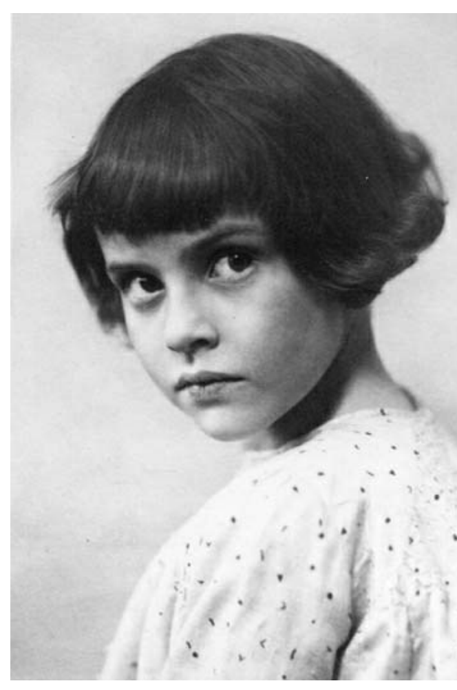
Leo Baeck Institute, New York

The story is narrated by a character named Daniel . Throughout the materials in this packet, the name Daniel is printed in italics. This is to serve as a reminder that Daniel is not a living individual, but a character in a story. The story is narrated through Daniel's diary, which serves as the main exhibition text. Throughout the exhibition white signs, called Gallery Guides, indicate what visitors are about to see before they see it. The Gallery Guides raise points for discussion and direct visitors to important elements in the exhibition.