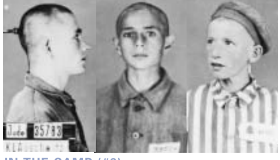
IN THE CAMP (#6)

Official camp photographs, or "mug shots," taken of three young Jewish boys in the killing center Auschwitz-Birkenau, no date.