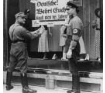
SCARY CHANGES (#2)

Two young boys stand in the fenced yard of the Central Prison, the primary assembly point for deportees from the Lodz ghetto. From here, children under ten years of age, the elderly, and the infirm were deported to the Chelmno killing center, where they were murdered in September 1942.