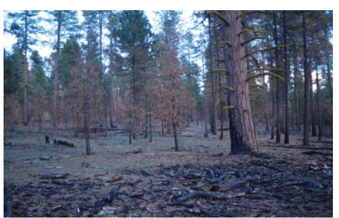
Typical underburn after prescribed fire.

fire was conducted in 1997, and the first spring fire in 1998. Fires were started with a drip torch in strips of a few acres each to eventually cover the entire plot. Canopy and ground cover were measured before and after fire, and the severity of the fire was calculated, from low to moderate to high, by measuring char height on tree boles and the thickness of the forest floor, the O horizon.