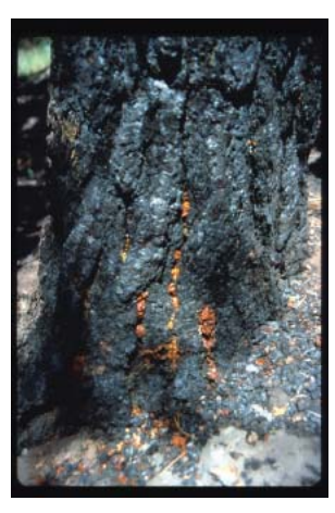
(Left) Black stain root disease attacks the roots and plugs the vessels, thus depriving the tree of water. (Right) After a burn, the red carpenter beetle ( Dendroctonus valens ) will attack the base of trees, causing a distinctive pitch to form.

stain root disease is a fungal disease of conifers that is thought to be carried by insects such as root feeding bark beetles, which emerge in the spring and early summer.