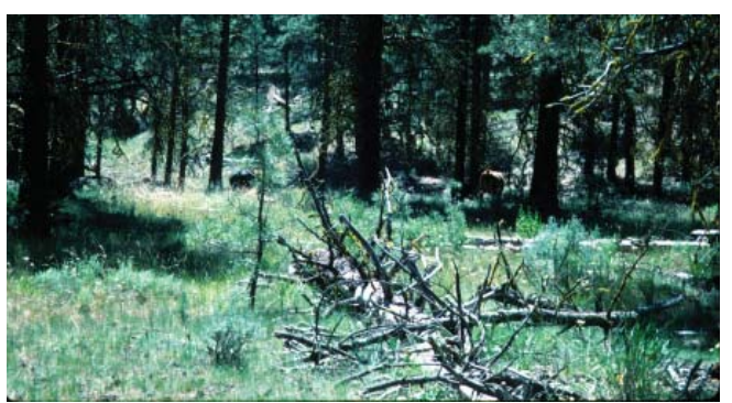
Season of Burn study area with typical fuel loads.

To answer some of these questions, the Forest Service and a number of public and private partners teamed up with researchers to work in concert, applying fire in spring and fall and at varying frequencies to reduce fuel load, and using the burn sites as an ongoing experimental laboratory.