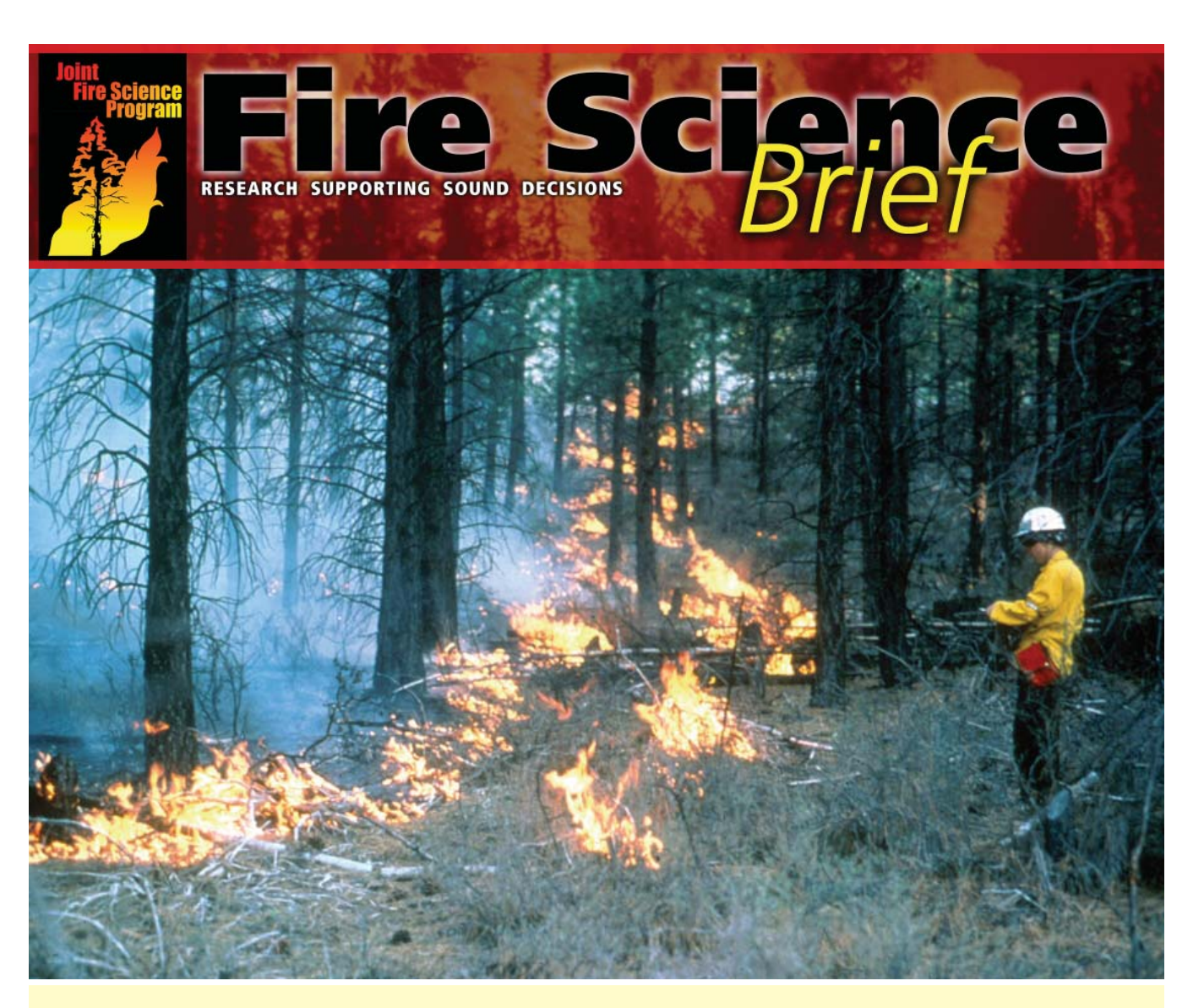
Lighting off an underburn in the study areas. Each area was about 30 acres.