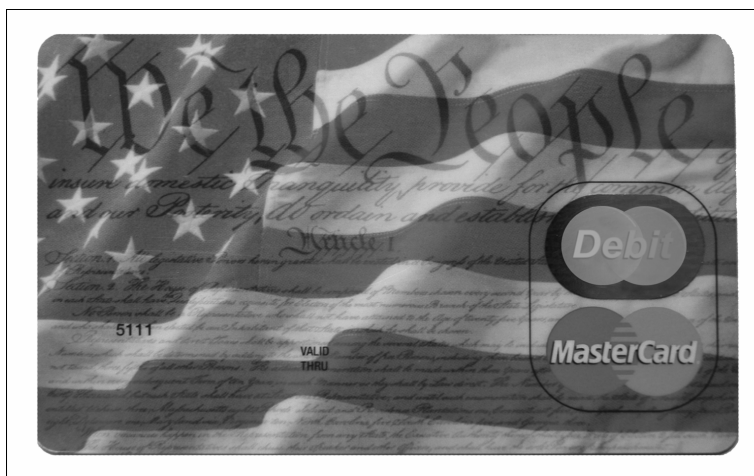
Figure 2: FEMA Debit Card

In the days following hurricane Katrina, FEMA experimented with the use of debit cards to expedite payments of $2,000 to about 11,000 disaster victims at three Texas shelters 10 who, according to FEMA, had difficulties accessing their bank accounts. Figure 2 is an example of a FEMA debit card.