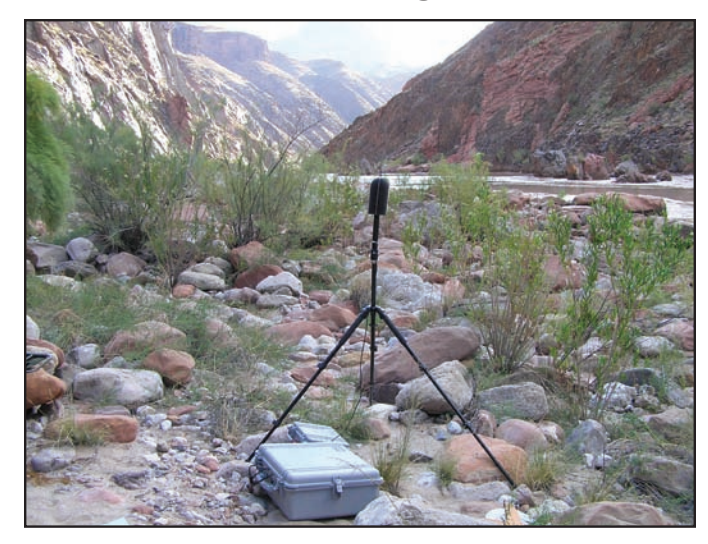
Acoustic monitoring equipment in Grand Canyon National Park.

The mission of the Natural Sounds Program is "...to protect, maintain, or restore acoustical environments throughout the National Park System. We fulfill this mission by working in partnership with parks and others to increase scientific and public understanding of the value and character of soundscapes and to eliminate or minimize noise intrusions."