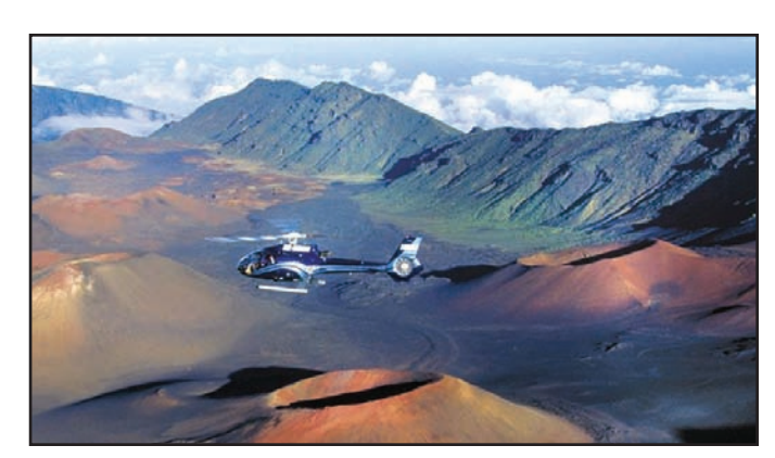
Helicopter flying over Haleakala National Park. The NPS Natural Sounds Program works with the Federal Aviation Administration to develop Air Tour Management Plans in national parks where commercial air tours operate.