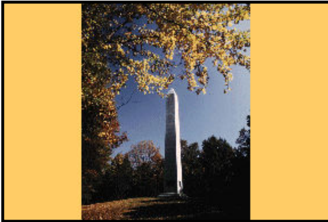
Kings Mountain NMP