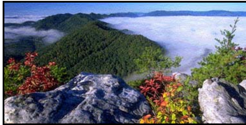
Cumberland Gap NHP