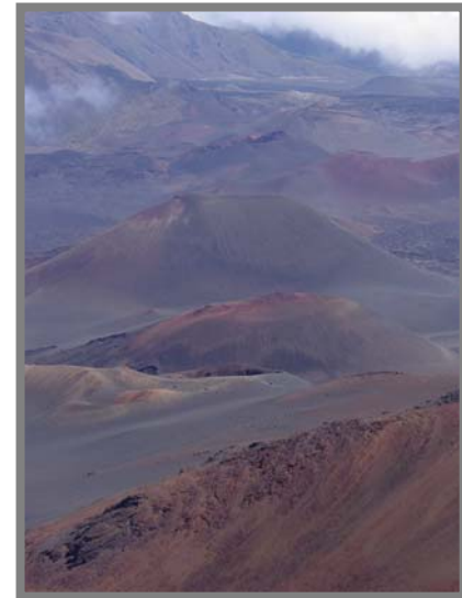
Haleakala NP, Maui