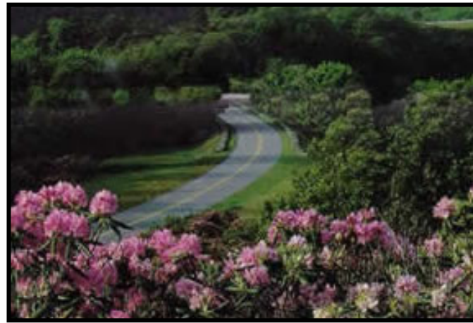
Blue Ridge Parkway