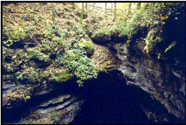
Mammoth Cave NP