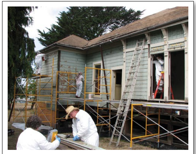
College of the Redwoods, Eureka, CA

Once initial exploratory conversations have occurred and the champion decides to move forward with a preservation trades curriculum overlay, he or she must begin to gather the necessary resources. The most effective way is to create