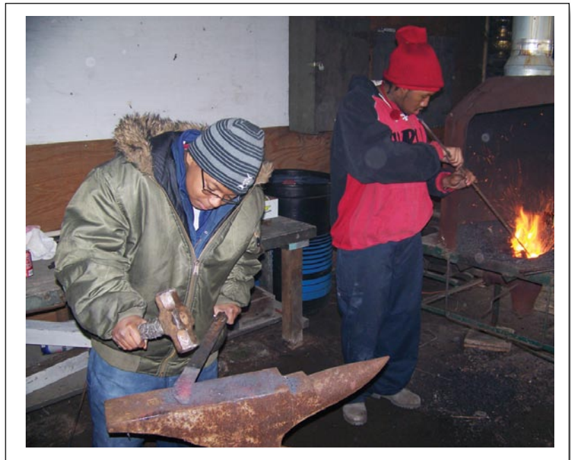
Randolph CTC, Detroit, MI