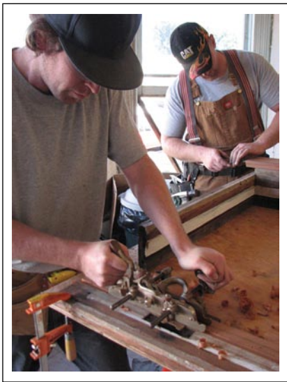
College of the Redwoods, Eureka, CA

From the discussions in Detroit and Tulsa, it was clear that there were three stages in a successful implementation: Making the Case, Implementing the Program, and Sustaining the Program during Change. Outlined below are the 21 steps typically required to move through these stages. The best practices and lessons learned are illustrated by real-life examples from the practitioners themselves and presented in their own words.