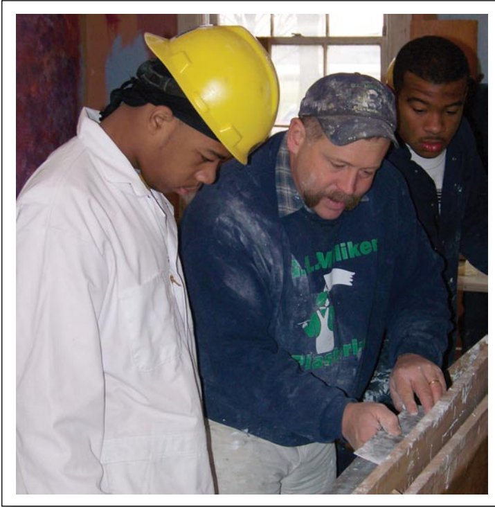
Randolph CTC, Detroit, MI