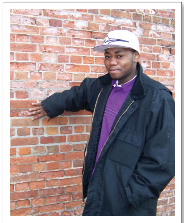
Randolph CTC, Detroit, MI