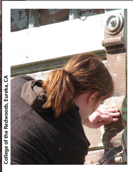
College of the Redwoods, Eureka, CA