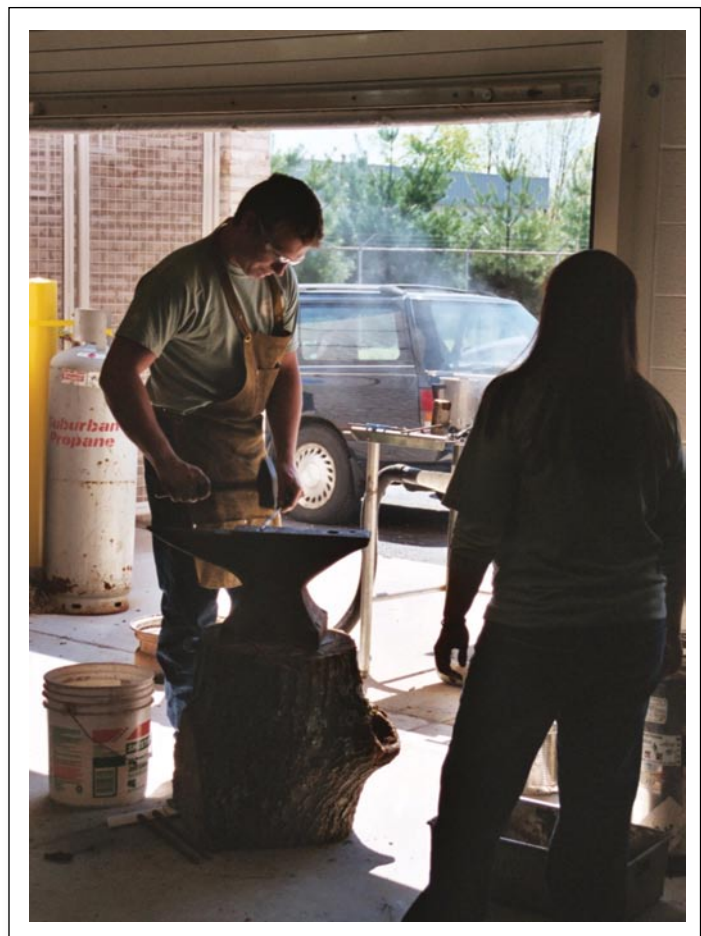
Harford Community College, Bel Air, MD