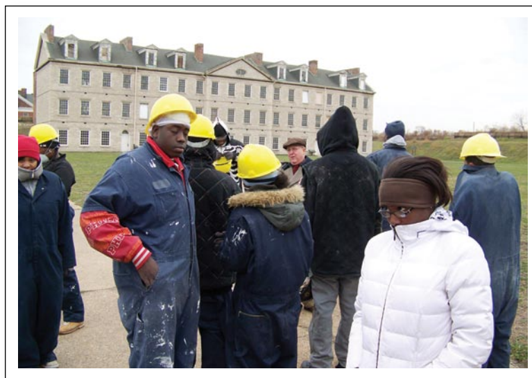
Randolph CTC, Detroit, MI