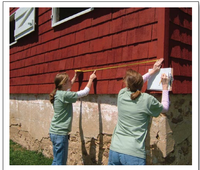
Harford Community College, Bel Air, MD

There can be presentations at parent-teacher conferences. Parents and grandparents are excellent allies and spokespersons for moving the program forward. Initially, the school needs their permission to enroll the student in the program. As the parents see the interest and pride of accomplishment in their student, they become strong advocates for the program and are well-positioned to exert influence. Parents place a high value on the potential job opportunities that the program creates.