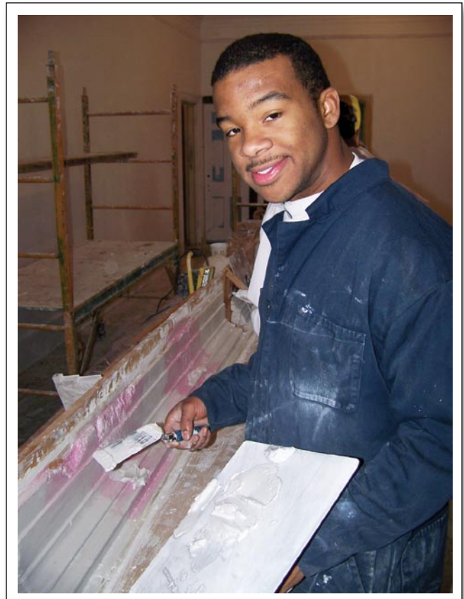
Randolph CTC, Detroit, MI

Once the go-ahead is acquired, the hard work of developing the program in detail begins. While using the Advisory Council for program development may increase the time expended up front to finalize the program details, it will also yield a better product and more buy-in for the program in the long run. The first task of the advisory council is to help develop the curriculum overlay. The second task is to help develop good on-site project and internship possibilities.