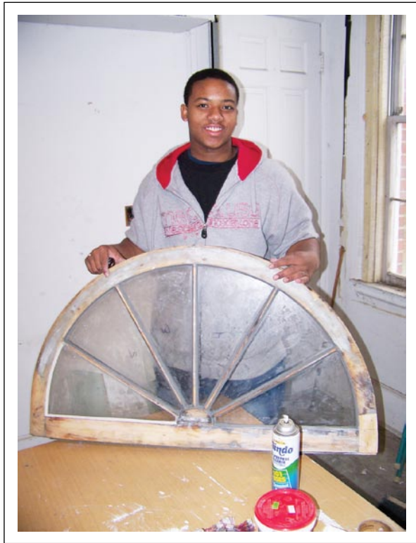
Randolph CTC, Detroit, MI