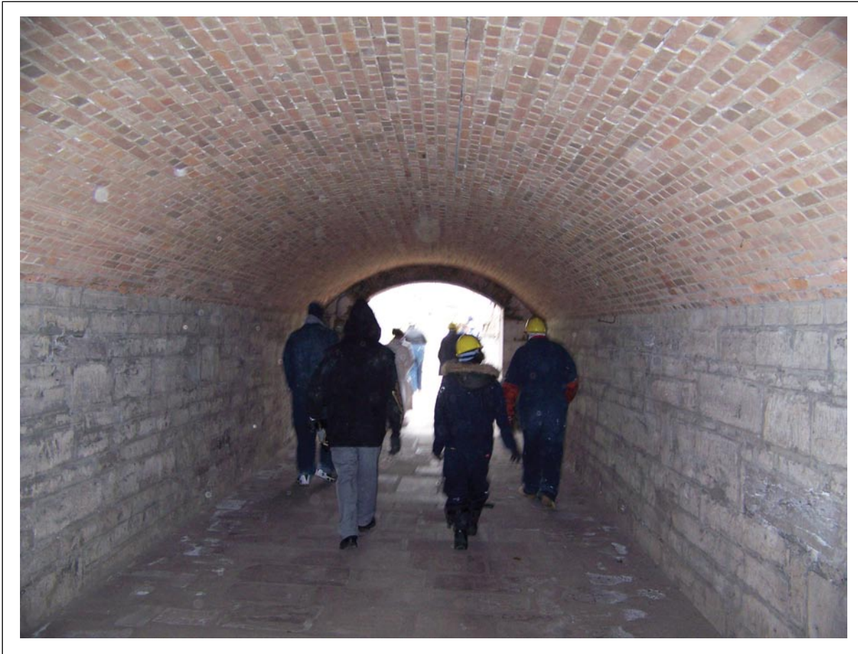
Randolph CTC, Detroit, MI