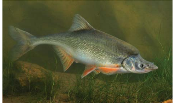
Figure 1. The humpback chub ( Gila cypha ) is an endangered freshwater fish found only in the Colorado River Basin. Recently collected data indicate that the number of adult fish (age-4+) in Grand Canyon stabilized between 2001 and 2005 after years of decline (photograph courtesy of George Andrejko, Arizona Game and Fish Department).

Since scientists began monitoring efforts in 1989, the population of adult humpback chub in Grand Canyon has declined