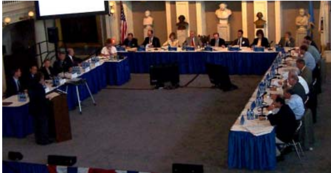
The Commission's guiding principles and other recommendations were based on input received at meetings throughout the nation, such as this one held in July 2002 at historic Faneuil Hall in Boston, Massachusetts.