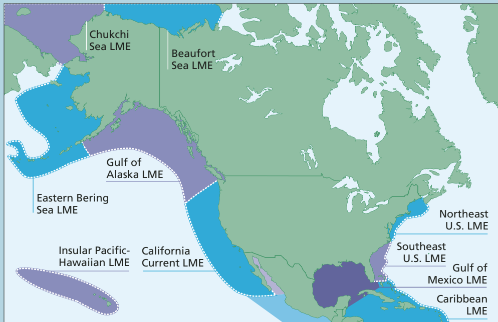
Figure 3.1 Large Marine Ecosystems Correspond to Natural Features

Ten large marine ecosystems (LMEs) have been identified for the United States. These LMEs are regions of the ocean starting in coastal areas and extending out to the seaward boundaries of continental shelves and major current systems. They take into account the biological and physical components of the marine environment as well as terrestrial features such as river basins and estuaries that drain into these ocean areas.