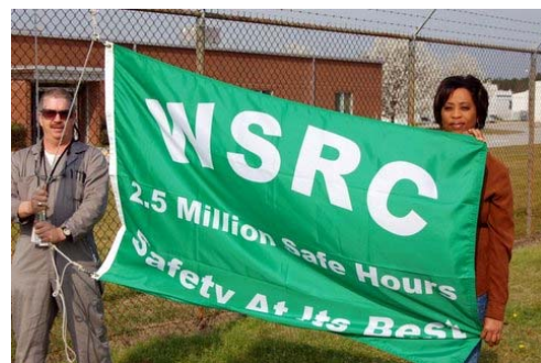
DWPF and Saltstone employees recently celebrated a special safety achievement.