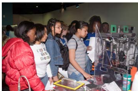
Scenes from Technology Days