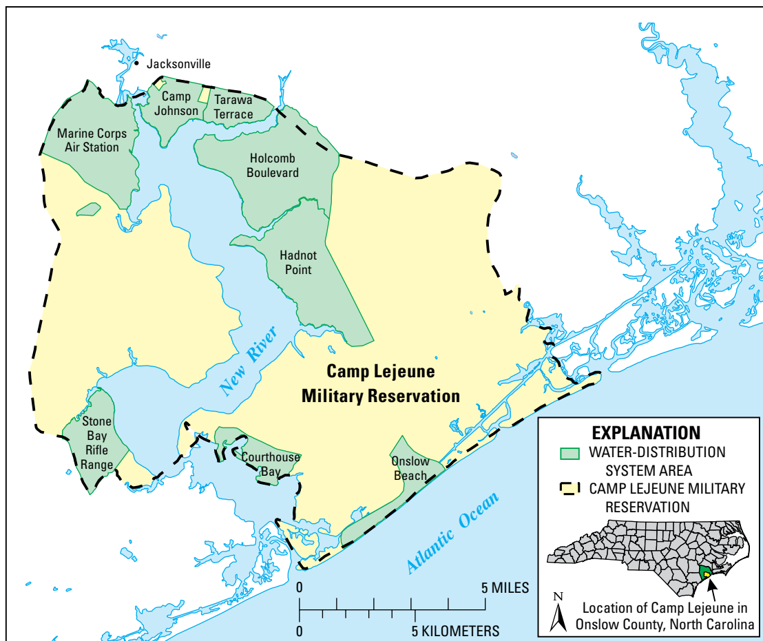
Figure 1. Location of U.S. Marine Corps Base, Camp Lejeune, North Carolina.

Underground storage tanks (USTs) used for storing waste-degreasing solvents were installed in the Hadnot Point area in the 1940s and 1950s. In 1954, ABC One-Hour Cleaners (ABC Cleaners) began operating about 500 ft north of the base. In 1958, a supply well for Tarawa Terrace family housing units was installed about 1,000 ft southeast of the cleaners, just west of the intersection of Lejeune Blvd. (Highway 24) and Tarawa Blvd. On-base sampling conducted from 1980–1985 identified volatile organic compound (VOC) contamination in Tarawa