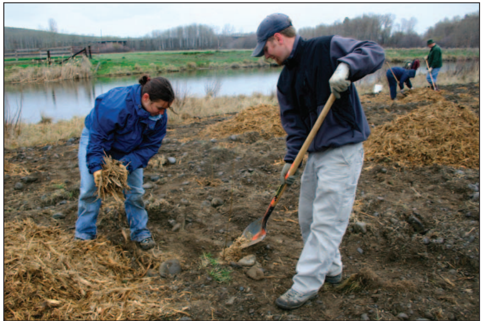
Under this new partnership, on-the-ground activities like the streambank restoration project pictured here will help provide spawning and rearing habitat for salmon.