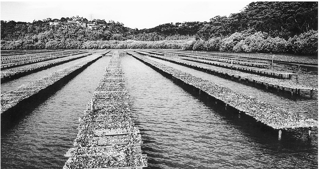
Figure 3.—Frames of sticks bearing two year old oysters on an intertidal rack in Merimbula Lake, NSW.