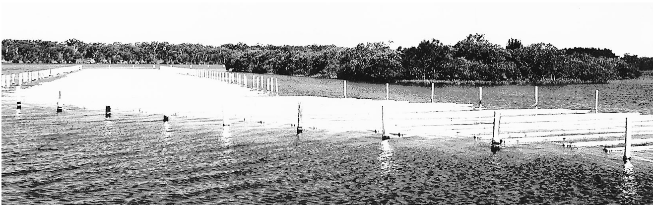
Figure 5.—Frames of sticks suspended below PVC pipes in floating culture, Wallis Lake, NSW.

During the 1950's and 1960's the NSW Sydney rock oyster industry exhibited consistent growth as production methods improved and total lease area increased. However, around 1970, production rapidly increased from about 10 to 14 million dozen or 6,000 to 8,400 t (wet weight including shell). Much of this increase was attributed to the rise in the number of farmers who transported oysters from estuary to estuary to take