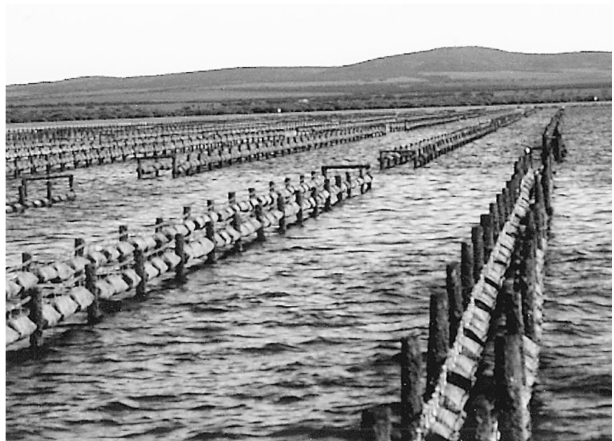
Figure 6.—Intertidal longline culture of Pacific oysters, Franklin Harbour, Cowell, South Australia.

Farming of the Pacific oyster in Tasmania began in the 1960’s (Wilson, 1970; Sumner, 1974; Dix, 1975). Wild caught spat were collected and grown using the same stick and tray system as used in NSW at that time (Wilson, 1970; Sumner, 1980a, b). With the development of hatchery production of spat in the 1980’s, the industry in Tas-