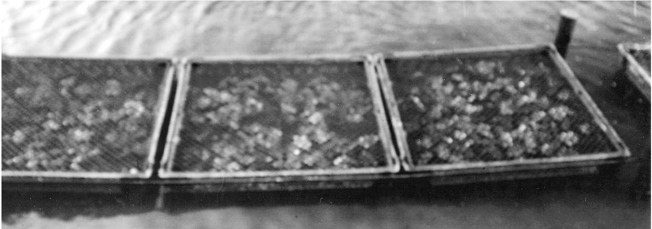
Figure 8.—Plastic oyster trays (93 × 93 cm), suspended from an intertidal longline, Georges Bay, St. Helens, Tasmania.

(Cameron 2 ) that after several generations of selective breeding these oysters breed “true” for the “golden” color and only produce “golden” oysters. A small niche market for “golden” oysters has been developed in Asia.