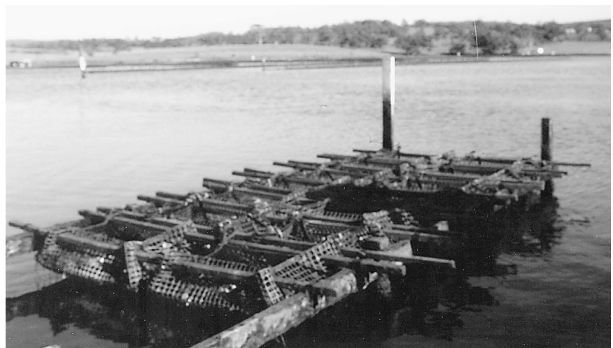
Figure 7.—Intertidal basket culture of Pacific oysters, Little Swanport, Tasmania.

mania rapidly expanded (Dix, 1991). It developed its own way of growing and handling oysters and adopted the basket culture system (Fig. 7). The baskets are made of folded plastic mesh and are generally around 28 cm wide and 47 cm long. Some farmers also use plastic trays (93 x 93 cm) for intertidal culture (Fig. 8). These trays can be stacked 6–14 high for subtidal culture.