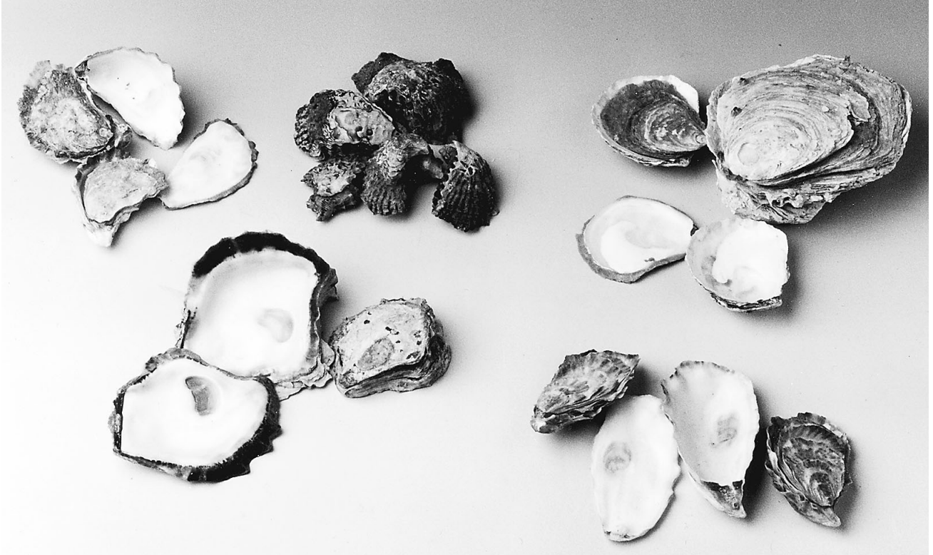
Figure 2.—From left to right, at the top, Sydney rock (66–86 mm shell height), coral rock or milky (59–79 mm), and flat oysters (71–77 mm) and at the bottom, black-lip (73–97) and Pacific oysters (76–104 mm).