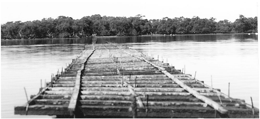
Figure 4.—Trays supporting fourth generation breeding lines of Sydney rock oysters, Port Stephens, NSW.

Disaster struck the industry in 1895 when mudworms killed large numbers of oysters (Smith, 1981/82). The industry also suffered oyster mortalities from floods in the rivers, theft, and the lack of secure oyster bank tenure. However, the mudworm was the single largest cause of production decline (Smith, 1981/82). In the 1970's outbreaks of QX disease caused by the haplosporidian parasite Marteilia sydneyi (Perkins and Wolf, 1976) led to a further decline (Nell, 1993). Since 1936, Queensland oyster farmers have imported half-grown oysters from NSW to grow them to market size (Smith, 1981/82).