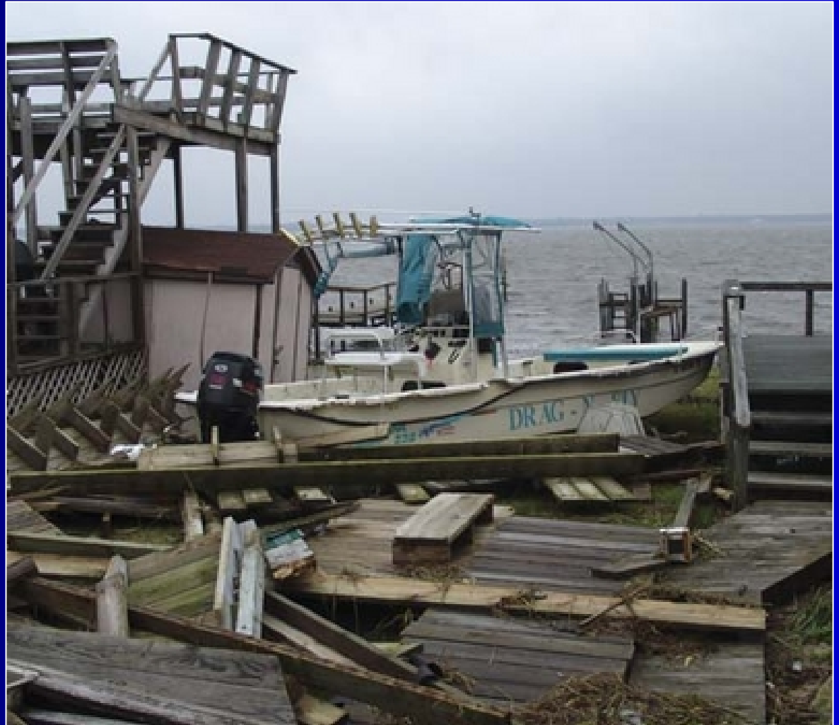
Damaged estuarine structures