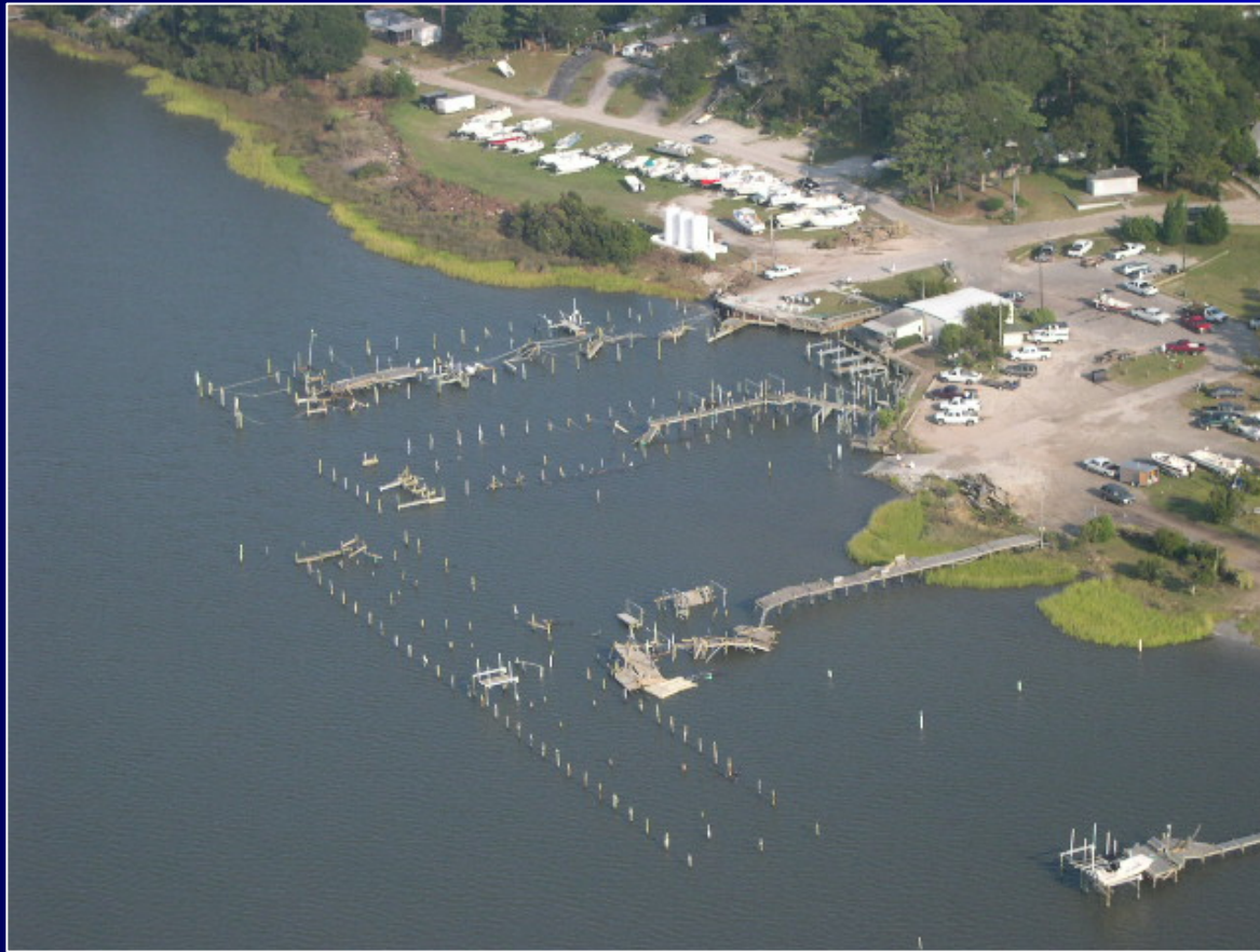
Island Harbor Marina - Emerald Isle, Carteret County

Typical damages consisted of damaged or destroyed estuarine structures. Some soundside erosion occurred in central coastal region and beach erosion in the southern region.