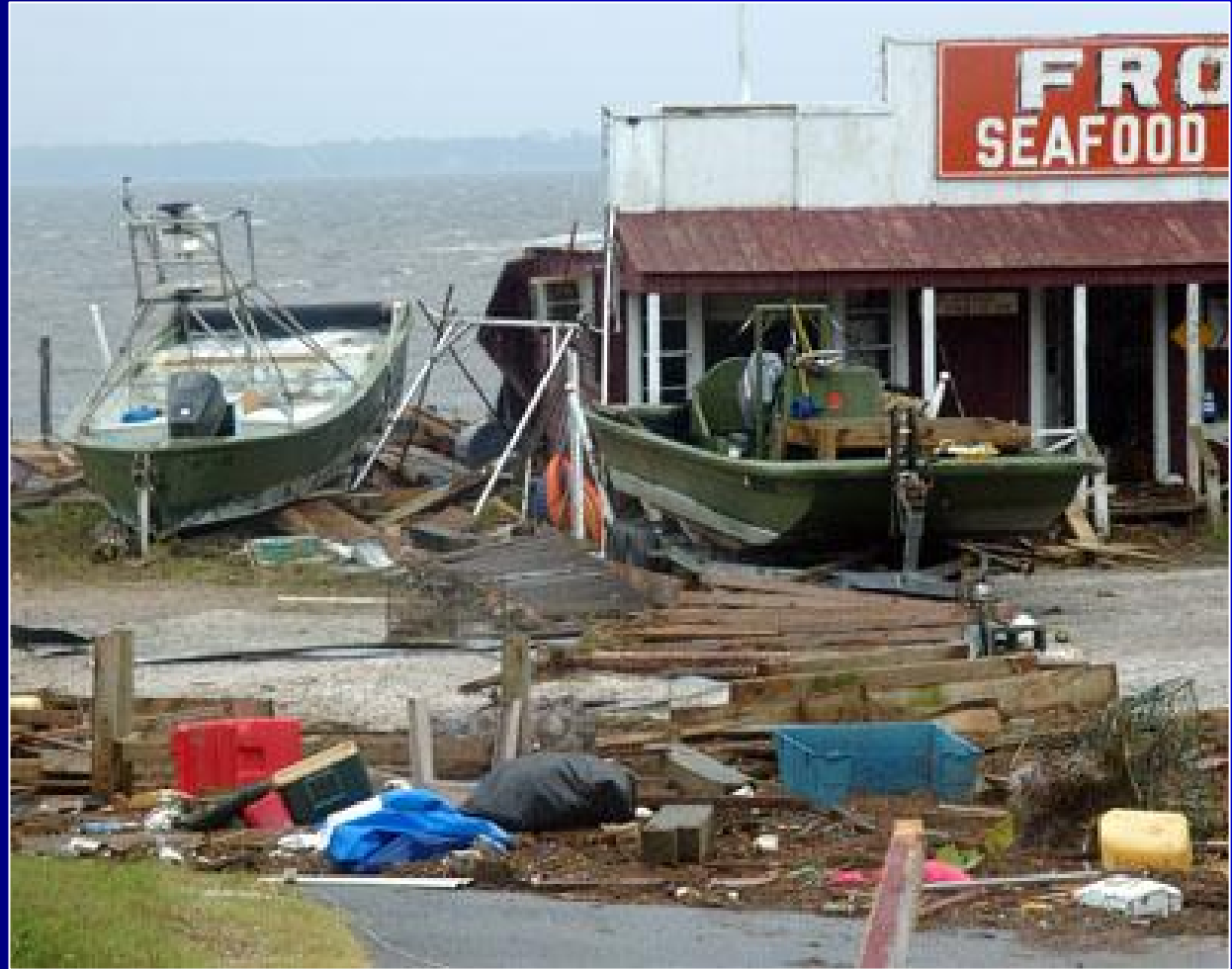
Salter Path, Carteret County