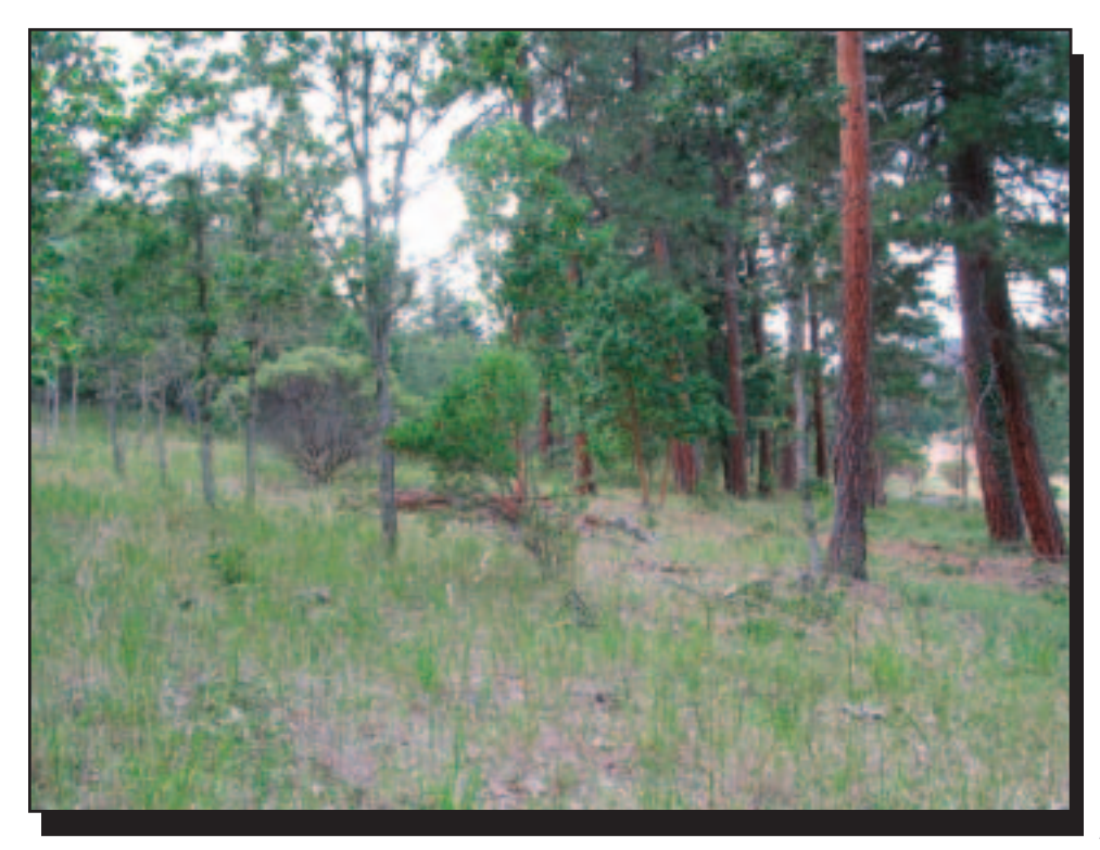
Figure 15—Ecosystem health has been restored and the risk of high-intensity wildland fire has been reduced after mechanical treatments, followed by low-intensity burning, in the ponderosa pine forest shown above.