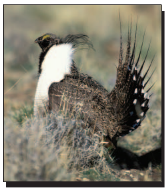
Figure 12—Rangeland resources often occur within a wildlandurban interface. Rangeland treatment can help reduce fuel and improve habitat management for species such as the sage grouse, which has been petitioned for listing under the ESA.