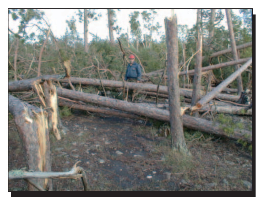
Figure 8—Blowdown on the Superior National Forest increased fuel loadings and the forest's susceptibility to insect infestations.