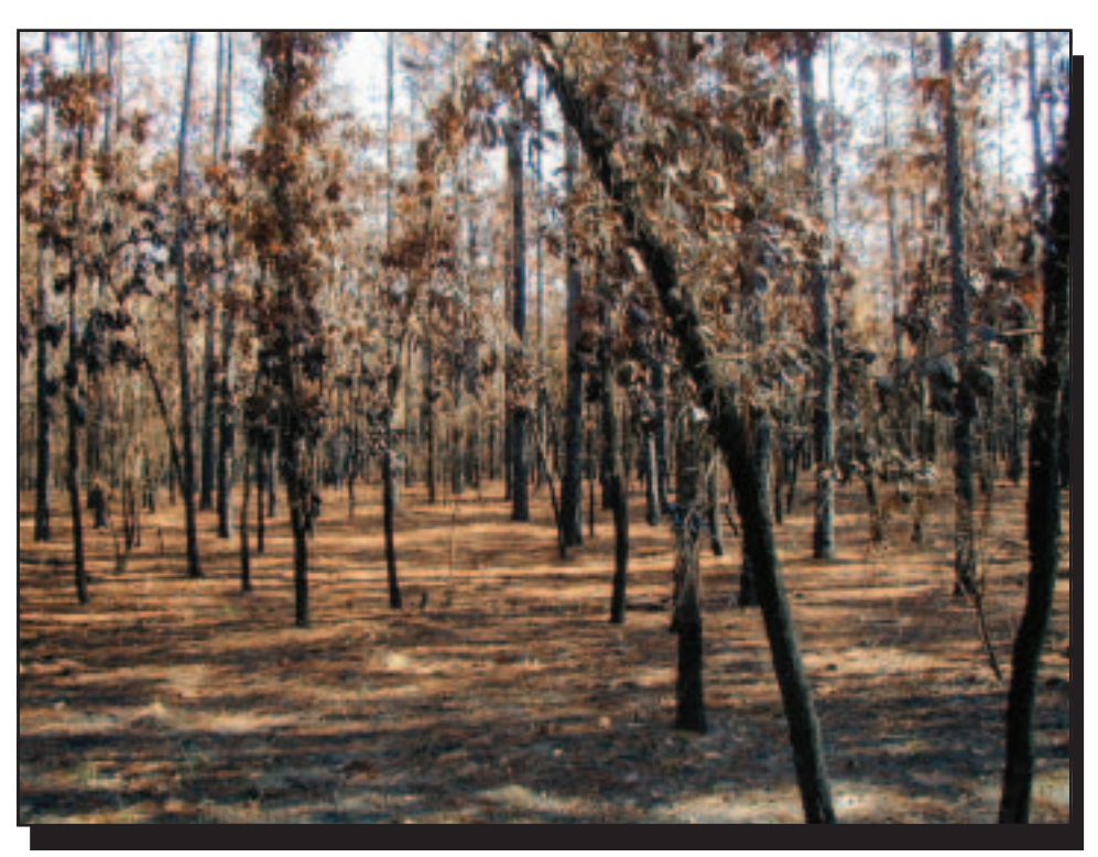
Figure 23—Maintaining stand and fuel conditions is a continuous requirement. This stand in Florida was burned in July 2001.