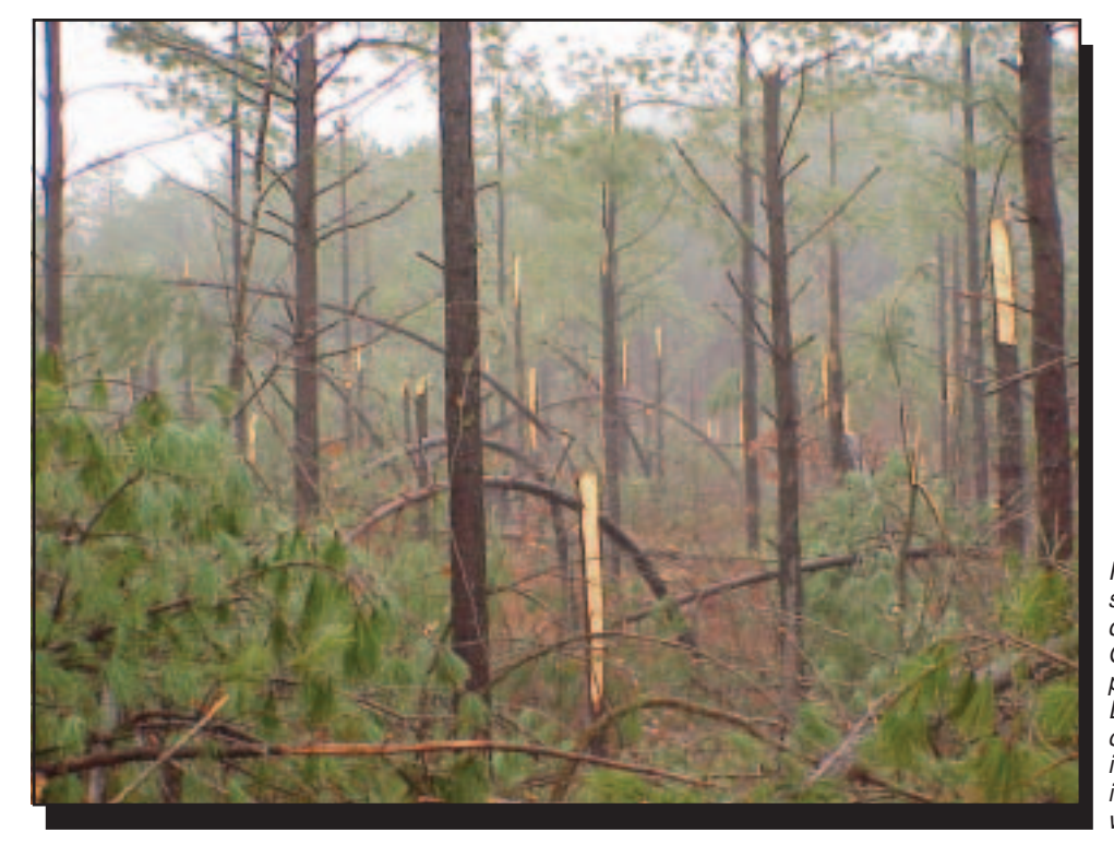
Figure 9—A December 2000 ice storm inflicted moderate to heavy damage across 340,000 acres of Ouachita National Forest and private lands in Arkansas. Damaged trees were more susceptible to insect and disease infestations, and fuel loads increased the risk of catastrophic wildland fire.