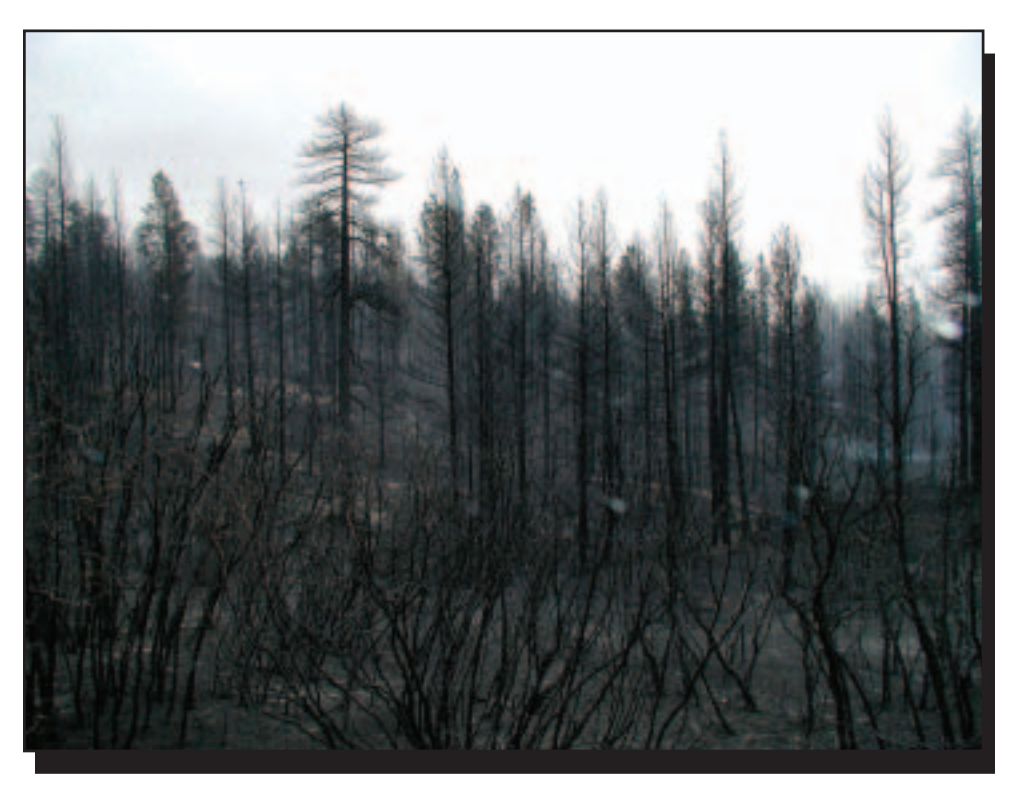
Figure 17—This stand (adjacent to the stand shown in figure 16) burned much more intensely the same day. Because this stand had not been treated, environmental damage was significantly greater.