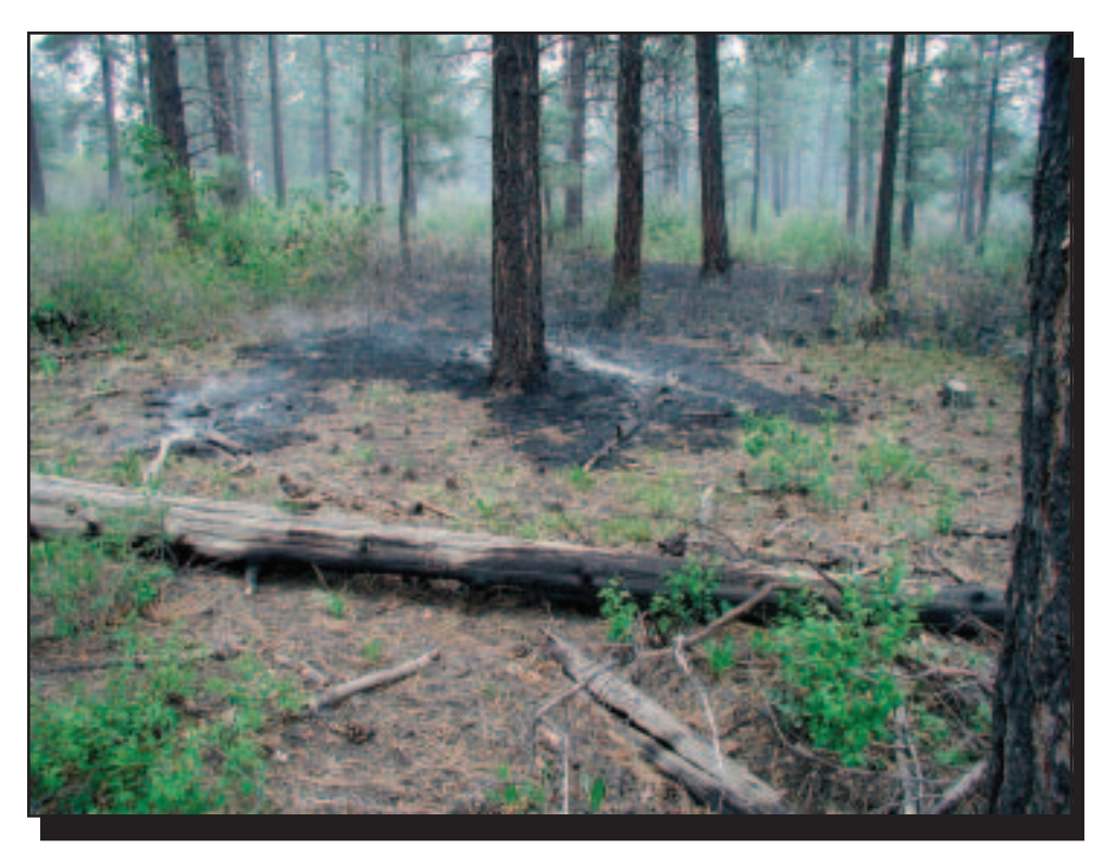
Figure 16—The Bucktail fire burned through this treated stand on the Uncompahgre National Forest in western Colorado. Burning within the stand was low intensity and patchy, despite the dead trees and branches on the forest floor.