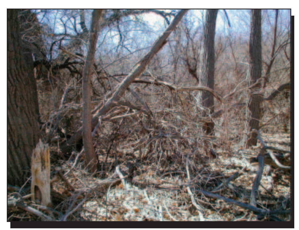
Figure 21—The Rio Grande bosque in New Mexico had high fuel loadings before fuel-reduction treatments.