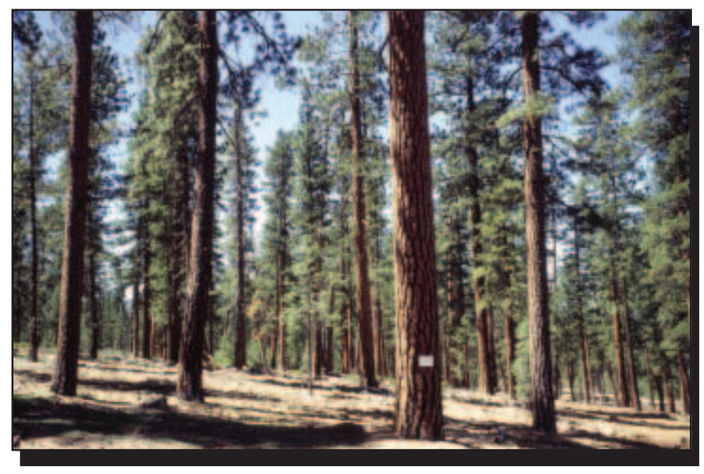
Figure 13—Hazardous-fuel treatments authorized by the HFRA in old-growth stands are intended to retain the "large trees contributing to old-growth structure." This old-growth ponderosa pine stand in the Lassen National Forest (California) was thinned, leaving large trees. Some of the trees that were removed were large enough to cut for lumber at a sawmill. Smaller trees were chipped and used as fuel to produce electricity.

Will "modify fire behavior, as measured by the projected reduction of uncharacteristically severe wildland fire effects for the forest type (such as adverse soil impacts, tree mortality, or other impacts)." In achieving this objective, vegetation treatments are to focus "largely" on small-diameter trees, thinning, strategic fuel breaks, and prescribed fire (figures 14 and 15).