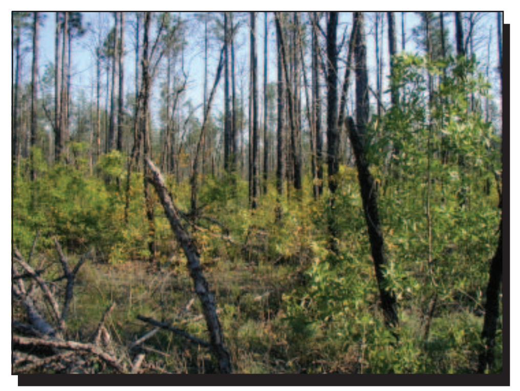
Figure 24—Vegetation recovery and regrowth 2 years after the photo in figure 23 suggests that this stand will need retreatment soon.