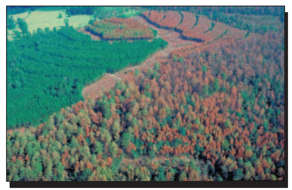
Figure 10—Epidemic levels of insects or diseases, such as this southern pine beetle outbreak at the Sam Houston National Forest in Texas, produce forest conditions that have all the ingredients leading to a fast-moving, high-intensity catastrophic wildland fire.

The Field Manager (DOI BLM) or Forest Supervisor (USDA Forest Service) will determine whether an epidemic exists under Section 102(a)(4) of the HFRA after consulting with forest health specialists (entomologists and pathologists) who know the factors that are relevant to such a determination.