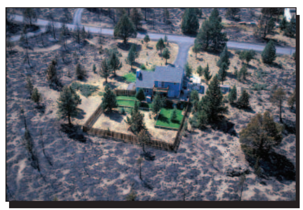
Figure 19—One of the keys to effective fire management is treating fuels adjacent to structures and on private and Federal land throughout the wildland-urban interface.

Adjacent to an evacuation route. There is no distance limitation for evacuation routes.