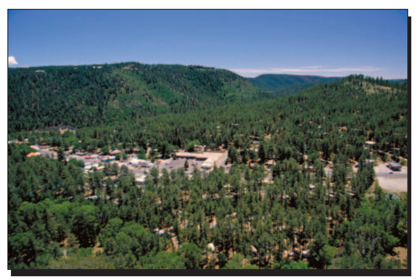
Figure 20—This complex wildland-urban interface illustrates the need for a Community Wildfire Protection Plan. Protecting such homes scattered throughout the forest can be a serious challenge for wildland firefighters.

The National Association of State Foresters is working with the Western Governors Association, the National Association of Counties, and the Society of American Foresters to develop a user-friendly guide to help communities get started in developing, or finalizing, their Community Wildfire Protection Plans (see <a href="http://www.fireplan.gov/content/reports">http://www.fireplan.gov/content/reports</a>). Regional, State, local, Tribal, or area administrators, or other Federal officials, Tribal leaders, and governors will collaborate on setting priorities and coordinating planning across jurisdictions to facilitate accomplishments at the local level. Ongoing communication should facilitate the exchange of technical information for fully informed decisions.