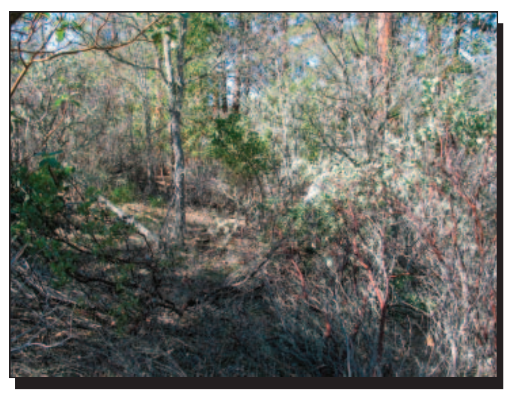
Figure 14—After decades of wildland fire exclusion, some ecosystems, such as this ponderosa pine forest in southern Oregon, have become overgrown and unhealthy, leaving them unsuitable for wildlife and hazardous to communities nearby.