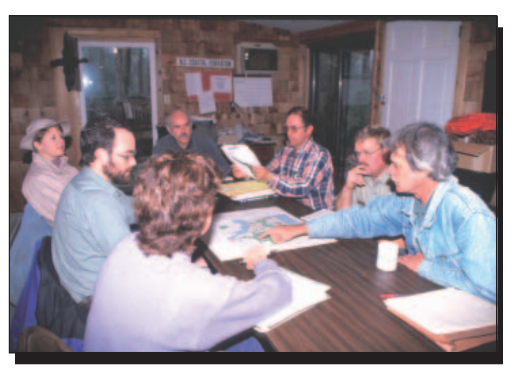
Figure 18—Effective collaboration at the community level is a cornerstone of all HFRA activities. This meeting took place at the Croatan National Forest in North Carolina.