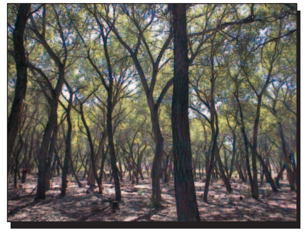
Figure 22—Fuel loading was significantly reduced by a combination of thinning and prescribed-fire treatments in the Rio Grande bosque. Wildland fire is less of a threat when stands are in this condition than when they are in the condition shown in figure 21 (the same stand before treatment).