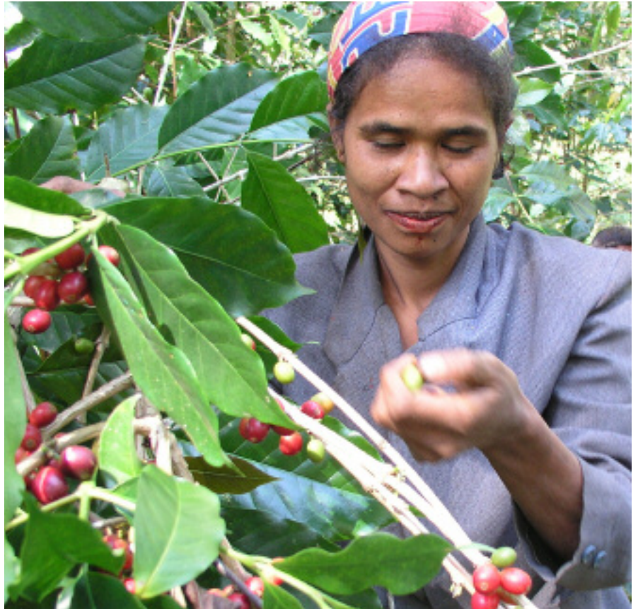
East Timor coffee farmers expand sales by identifying potential markets for certified organic coffee.

The United States is the largest single-country donor of TCB assistance, providing over $1.34 billion in 2005, up from $921.2 million in 2004. The United States' Millennium Challenge Account (MCA) contributed to TCB funding for the first time this year, complementing on-going U.S. programs. In addition, we continue our strong support for the trade-related programs of the multilateral