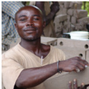
In Uganda, TCB helps small businesses grow.

At the country level, U.S. donor agencies and their field missions actively look for opportunities to integrate national priorities identified through the IF process into their long-term regional and country assistance programs. In Mali and Mozambique, USAID field missions are providing continuous support to the National Steering Committees in their roles as the local “IF donor facilitator.” Mozambique’s success in mobilizing high level public and private sector support for the IF, and a coordinated local donor response, has been identified as a “best practice” for overall management of the IF process.