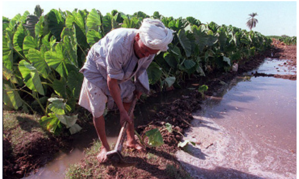
Improving productivity of the agriculture sector in Egypt.

Economic growth, trade expansion, and increased income-earning opportunities in developing countries are often linked to the agriculture sector. Trade-related standards, changing consumer preferences, and international advancements in science and technology are important factors