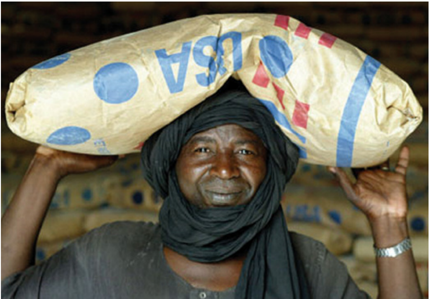
U.S. regional programs in West Africa support local populations.

In Monterrey, Mexico, President George W. Bush called for a new compact for global development to link greater contributions from developed nations to greater responsibility from developing nations. In response, the United States established the MCC in 2004 to work with some of the