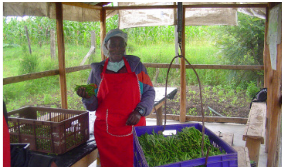
Farmers in Kenya grade, weigh, and store produce to maintain quality and safety.