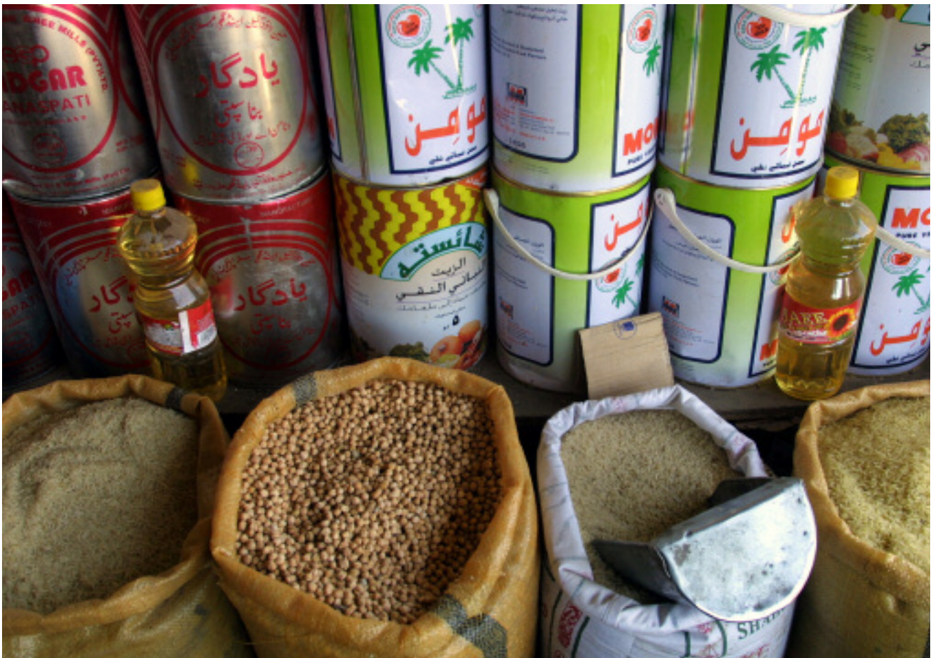
Grain at a market in Afghanistan.

provided WTO accession and implementation services to Nepal, which officially became a WTO member in 2003, and Cape Verde and Saudi Arabia. Ukraine and a number of other countries in Eastern Europe and the former Soviet Union also have benefited from U.S. support in this area. In 2004, USAID responded to Ethiopia's request for assistance in its accession process by initiating a major, three-year project. The United States provided broad accession support in 2004 to Iraq and Afghanistan.