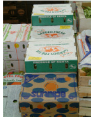
Produce from Kenya ready for shipment, locally or worldwide.

Other assistance ranges from energy services to sustainable tourism. The South Asia Regional Initiative includes an energy component that promotes mutually beneficial energy linkages among the nations of South Asia. The program promotes an understanding of the benefits of regional energy trade and builds capacity for energy trading opportunities. In Ecuador, technical assistance and training supports local-based ecotourism as a productive alternative to overfishing, enhances local governance, and promotes a marine zoning plan.