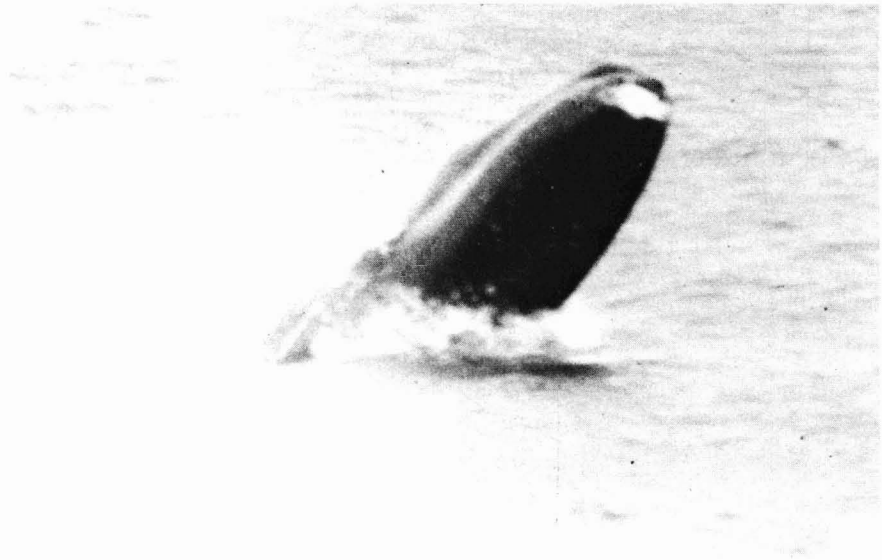
Figure 3. — Breaching bowhead whale near Point Hope, Alaska. Note white chin patch. Photograph by Geoffrey Carroll, 18 May 1977.

back to the center of the polynya as they continued stroking, rolling, and showing their flukes as they dove. The largest whale exhaled with a controlled flatulent sound from its blowhole. It surfaced very high and swam backwards (behavior also reported by Bodfish, 1936), pushing itself up with its flippers and pulling down with its flukes, all the while making a low groaning sound. We assumed their be-