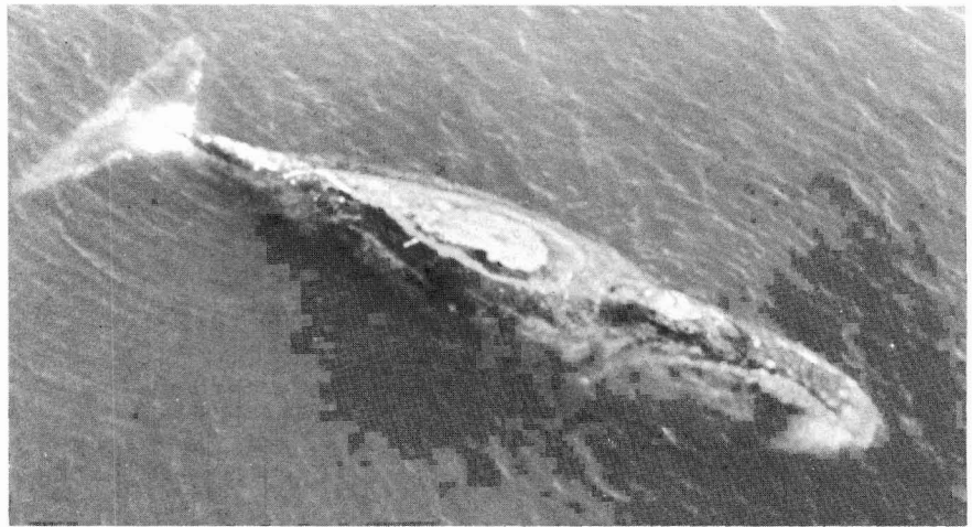
Figure 2. — Bowhead whale resting at the surface. White spot on back is believed to be ice or glare. 13 June 1976.