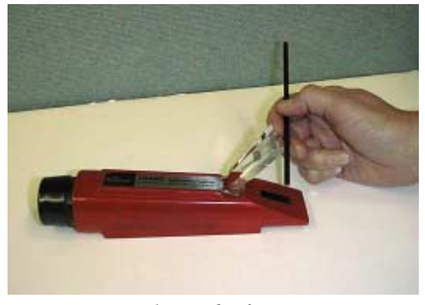
Figure 1-Hand refractometer

Hand-held refractometers use arbitrary scales, which may differ between manufacturers. The acceptable values given in the tables were developed for a specific instrument. Other refractometers may be equally suitable but unless they use the same scale, the readings will not relate to the values provided.