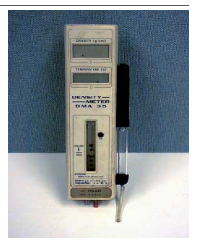
Figure 3–Hand-Held density meter

The viscosity and elasticity have a major impact on the characteristics of a retardant drop. The viscosity of the retardant solution is easily measured, however, the performance of a particular retardant is dependent on properties, more difficult to measure, other than viscosity. The retardant with the highest