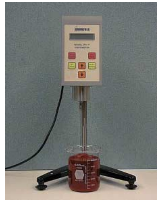
Figure 5–Brookfield viscometer