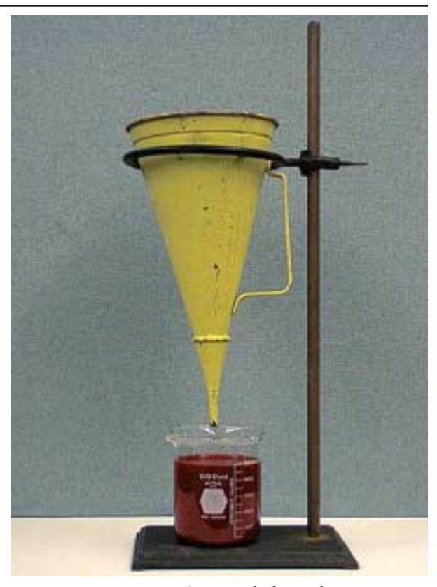
Figure 4–Marsh funnel

Viscosity values during laboratory or field evaluations are usually determined using a Brookfield viscometer (Model LVF) shown in figure 5. The Brookfield viscometer is not used during routine base operations because of the cost of the instrument and its delicacy.