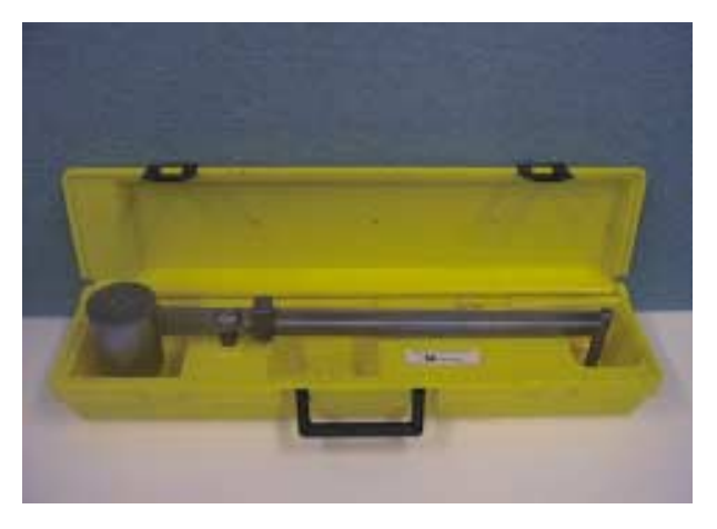
Figure 2-Mud balance

The specific weight of a retardant is the weight of one gallon of the mixed retardant, expressed in pounds. Although specific weight is a less accurate indication of salt content than the other measurements, the specific weight can be an indicator of whether or not the retardant is properly mixed. Entrapped air must be removed to obtain accurate specific weights. A mud balance, shown in figure 2, can be used to determine the specific weight.