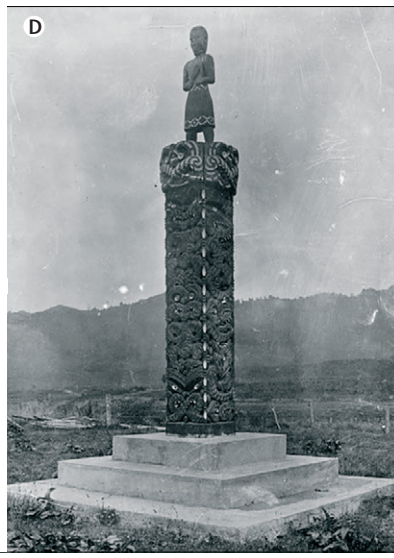
Figure 2: Examples of modern and historically important emerging infectious diseases (A) Emerging epidemics caused by war and famine. Plague in an Ancient City, by Michael Sweerts, circa 1652, represents the Plague of Athens. Oil on canvas, Los Angeles County Museum of Art, CA, USA. The infamous epidemic, the cause of which is still unidentified, occurred during the Peloponnesian wars between Athens and Sparta (430–426 BC). (B) Emerging epidemics associated with intent to harm. The Black Death (bubonic/pneumonic plague) of 14th century Europe was associated with a bioterrorist attack at Caffa. The untitled and anonymous painting has been referred to as Death Strangling a Victim of the Plague (circa 1376; Clementinum Collection of Tracts by Thomas of Stitny, also known as Stitny Codex, University Library, Prague, Czech Republic). Photo credit Werner Forman, Art Resource/NY. (C) Emerging epidemics due to travel and trade. Honoré Daumier's depiction (hand-tinted woodcut) of the 1832 Paris choléra-morbus epidemic, To which spread slowly from Asia to Europe along established travel routes. National Library of Medicine, History of Medicine Division. (D) Emerging epidemics associated with microbial adaptation and change. A Maori (New Zealand Polynesian) cenotaph (monument honouring the dead) at a marae (meeting place), Te Koura, New Zealand, memorialises those who died in the 1918–19 influenza pandemic. Photographed by Albert Percy Godber. Cenotaph designed and carved by Tene Waiter. Alexander Turnbull Library, National Library of New Zealand, Wellington, New Zealand.

had died,<sup>49</sup> presumably largely because of smallpox and additional imported diseases. Smallpox spread southward into South America, ultimately destroying two great civilizations, the Aztec and Inca empires, facilitating Spanish conquests that greatly altered history. Francisco Pizarro, who continued Spanish conquests of South America in the 1530s, is alleged to have undertaken a bioterrorist attack on native peoples using smallpox-contaminated blankets.<sup>50</sup> Mexico became a regional geographic reservoir for smallpox and was the source of repeated exportations until the 1940s.