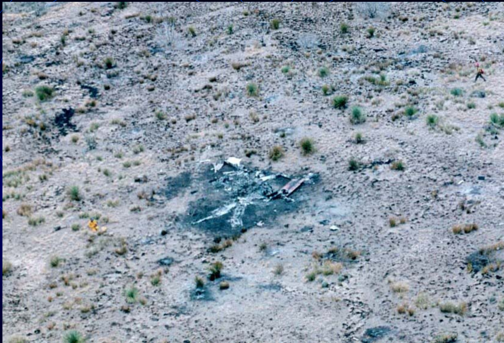
Overhead view of mishap site