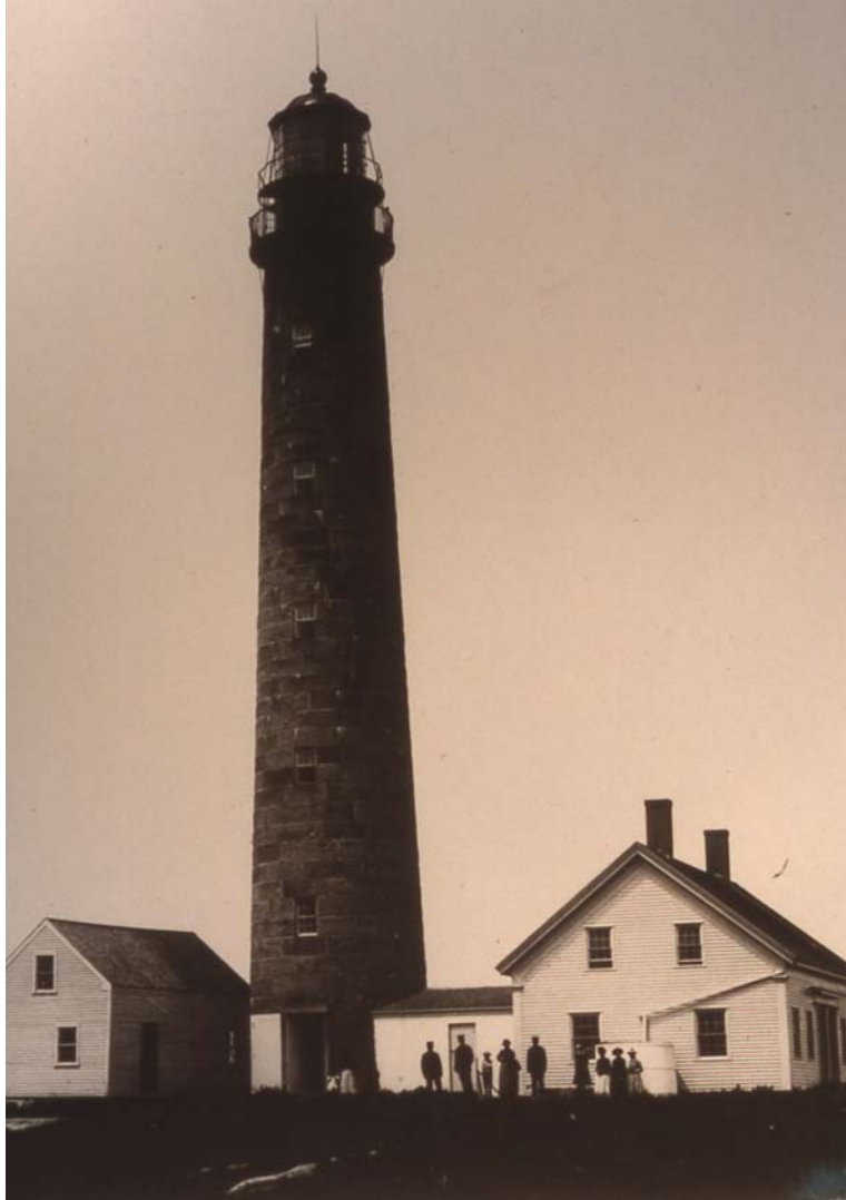
Historic photo of Petit Manan Island Lighthouse