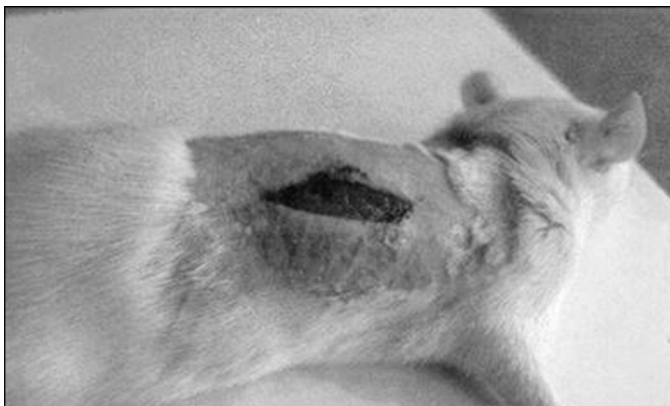
Figure 1. Sample of full-thickness skin wound on guinea pig 1 day after incision.

We measured the DSSP of the wound site relative to the adjacent intact skin at a distance of 2 cm; the reference electrode was always placed distally on intact skin ( Figure 2 ). The DSSP of the wound was measured before injury, immediately after injury, and once a day throughout the healing period. In each session, we measured the wound potential three times for 20 minutes each time.