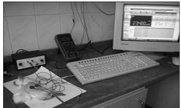
Figure 2. Setup for measuring wound site differential potential.

Before wounding, the mean \pm standard deviation DSSP was -0.5 \pm 1.75 mV for the control group, 0.09 \pm 0.82 mV for the cathodal group, and -0.42 \pm 1.15 mV for the anodal group. Paired t -tests showed that in each group, the wound site differential potential (wound potential) increased significantly immediately after wounding ( p < 0.05 ) ( Figure 3 ). The maximum wound potential value was not obtained immediately after injury but occurred 1 day later in the control and cathodal groups and 3 days later in anodal group. After these maximum