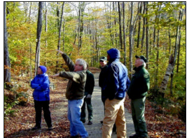
Autumn's brilliant colors attract scores of visitors bound to benefit from descriptive instruction on the interpretive trail.

The Discovery Trail is proof that stewardship contracting can benefit local contractors, the Forest Service, and stakeholders of the national forests. It also demonstrates that through "hands-on discovery" at national forest sites, urban visitors to the Northwoods can better understand the role of working forests.