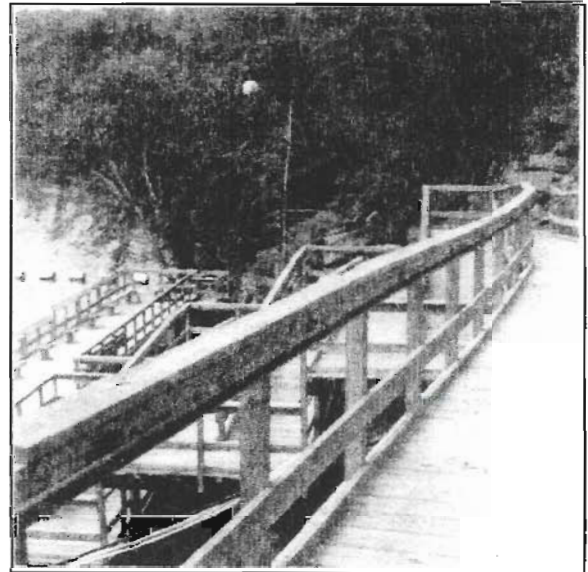
Since 1974, licensees have been required to consider the needs of disabled people in the design and construction of recreation facilities at hydropower sites.

Public demand for recreation and federal policies addressing that demand have continued to evolve since the 1960's. By the late 1970's, the ORRRC's projections for public participation in recreation for the year 2000 were already exceeded. To reassess the nation's recreation needs, President Reagan established the President's Commission on Americans Outdoors by Executive Order 12503 in 1985. After 2 years of work, the Commission, in its publication, "Americans Outdoors: The Legacy, the Challenge" reported that demand for recreation would continue to increase.