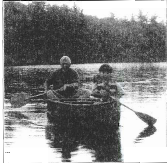
Order 313 states the Commission's intent to include recreation license articles for licensee's seeking substantial amendments, if such articles were not previously included.

President Kennedy responded to the growing demand for recreation by issuing Executive Order 11017 on April 27, 1962. The Order established the Recreation Advisory Council to coordinate outdoor recreation policy and provide advice to all agency heads. The FPC acted by issuing a notice of proposed rule-making in 1962 that culminated with the issuance of Order 260-A on April 25, 1963. The Order amended Section 4.41 of the Commission's regulations (18 CFR Part 4, Subpart E, §4.41 - Contents of application) to require the filing of a recreation resource plan for all major license applications filed after June 1, 1963.