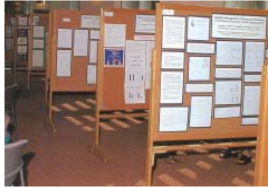
Iowa City VAMC