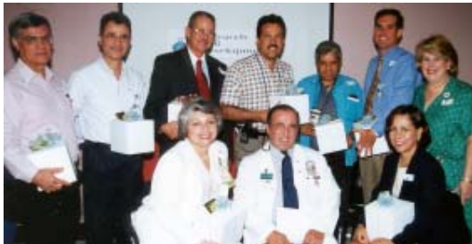
San Juan VAMC

The San Juan medical center sponsored a breakfast in appreciation of research volunteers and staff. Special plaques were presented to individuals who contributed to the research program, including statisticians, social workers, community representatives, facility management, nuclear medicine representatives, and medical media.