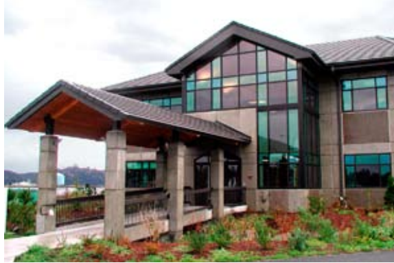
Captain R. Barry Fisher Building in Newport, Oregon.

All Newport Center scientists are based on Oregon State University's Hatfield Marine Science Center campus with about half the staff located in the new Captain R. Barry Fisher Building. The Newport station has a number of critical research facilities, including an ageing lab, a necropsy lab, a large flow-through seawater system, and specialized aquaria to conduct immunological and disease studies. Newport scientists use state-of-the-art tools and technologies, including acoustic technologies, side scan sonar, remotely operated vehicles, and laser line scan imaging. In addition, the Hatfield Marine Science Center's dock is used by NOAA research vessels and cooperative research vessels as a staging area for the Center's at-sea operations.