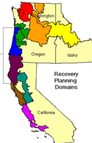
Oregon/Northern California Technical Recovery Team

Newport scientists are directly involved in salmon recovery efforts; they are co-leading the Oregon and Northern California Coast Technical Recovery Team (TRT). This TRT is identifying independent coho populations in the region using genetic, habitat, and behavior information, assessing factors responsible for coho salmon decline (like habitat destruction and climate variability) and developing recovery goals (e.g., how many fish should there be and how should they be distributed in coastal rivers and streams?). Newport scientists are also developing models of coho salmon life history that incorporate habitat, climate, and harvest to help understand how the many factors influencing salmon in freshwater and the ocean interact to affect recovery plans.