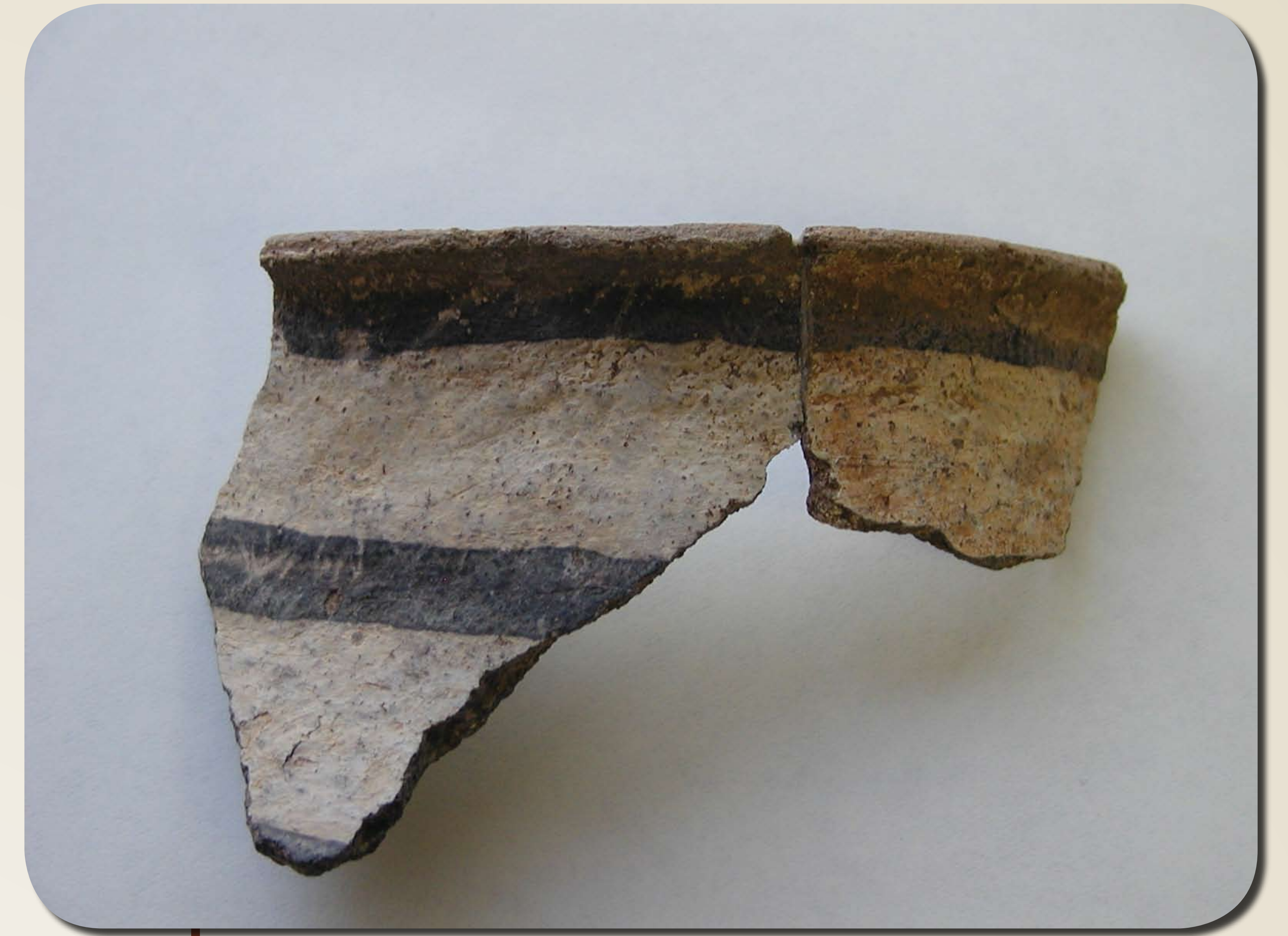
RECONSTRUCTED CERAMIC RIM

HOW WOULD YOU FEEL TO FIND THE LAST CHAPTER OF A NOVEL YOU WERE READING MISSING? IF IT WERE AN EXCITING BOOK YOU WOULD PROBABLY BE VERY DISAPPOINTED. THIS IS WHAT ARCHAEOLOGISTS ENCOUNTER WHEN THEY TRY TO STUDY A SITE THAT HAS BEEN COLLECTED OR VANDALIZED BY PEOPLE. IT MAY SEEM HARMLESS TO TAKE AN ARTIFACT FROM A SITE, BUT IT IS LIKE REMOVING PIECES OF A PUZZLE OR PAGES FROM A BOOK. IT DOES NOT TAKE LONG BEFORE VALUABLE INFORMATION IS LOST FROM A SITE FOREVER.