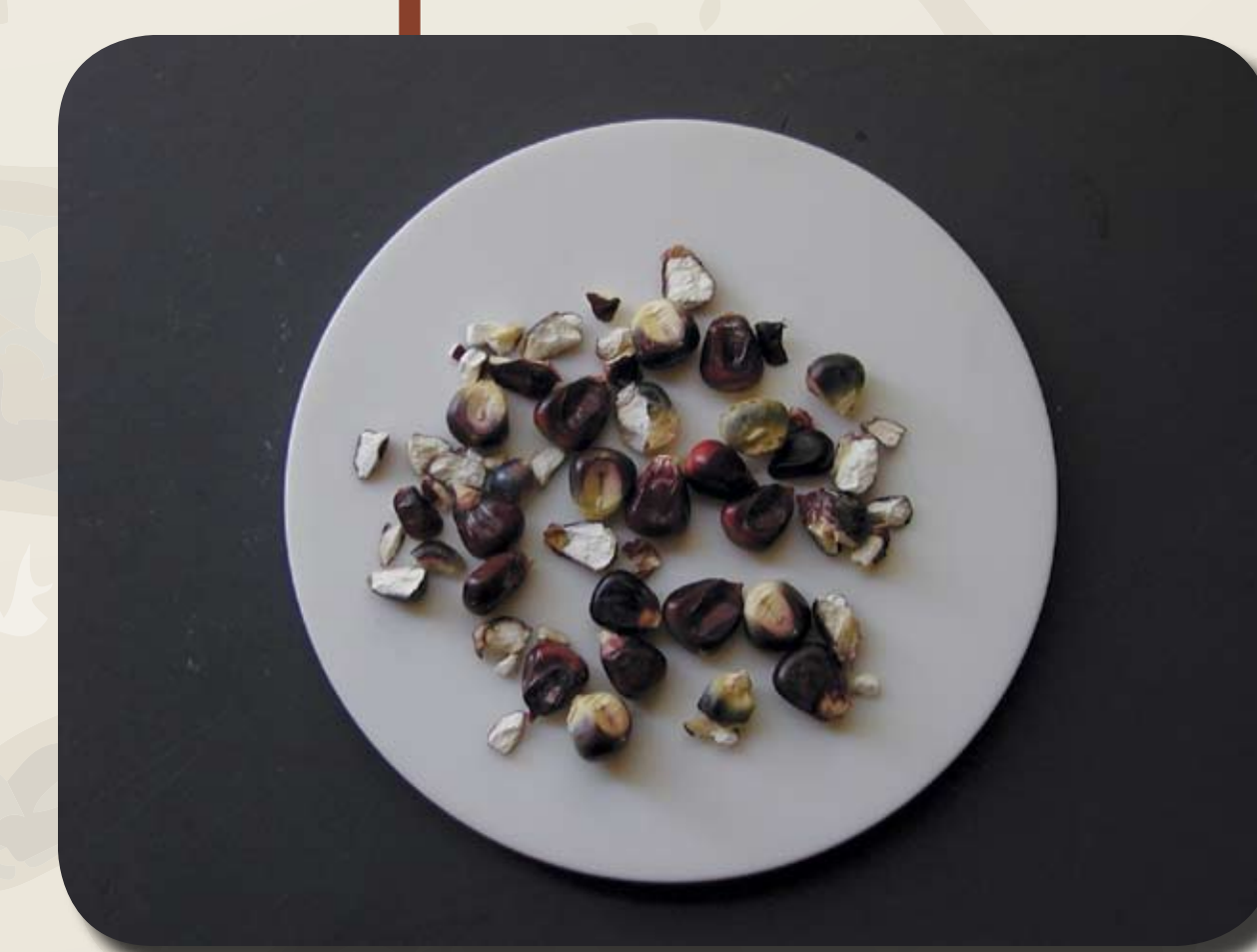
STUDY OF PLANT AND ANIMAL REMAINS