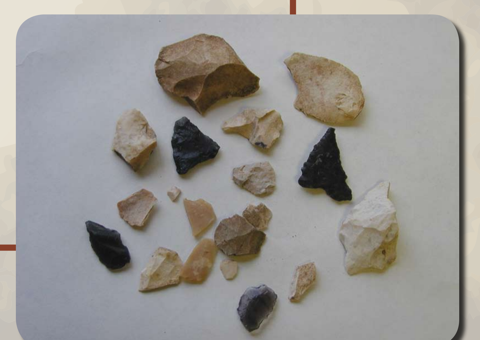
STUDY OF STONE TOOLS