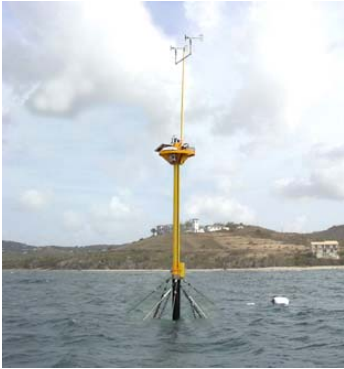
Coral monitoring (CREWS) station in the US Virgin Islands