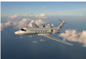
NOAA's Gulfstream 4 jet used in AOML synoptic surveillance research missions

1315 East West Highway Silver Spring, MD 20910 (301) 713-1671 www.oar.noaa.gov