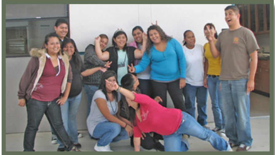
Above Picture: Orange Cove GG students acting a little silly.

Throughout the school year the Generation Green (GG) club is very active within the school and in the community. However, this summer students were involved in many activities in and out of the state. Some of these activities were Resources and People (RAP) Camp in Oregon, the Sacramento State Fair Leadership Camp (Camp Smokey) in Sacramento, Crystal Caves, Sequoia-Kings Canyon Expedition, Wonder Valley leadership retreat, and the Reedley Fiesta Parade.