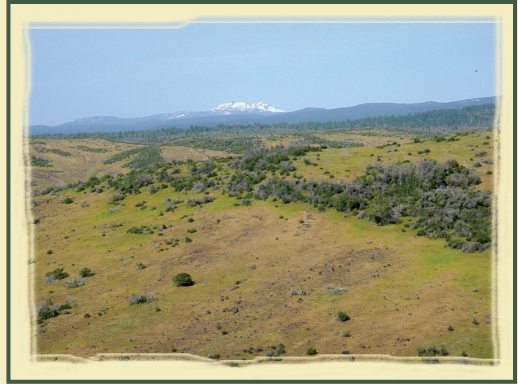
Lassen Peak from the Peligreen OHV Trail

Call or visit any of these offices for current road condition information, or to purchase a Lassen National Forest Visitor Map: