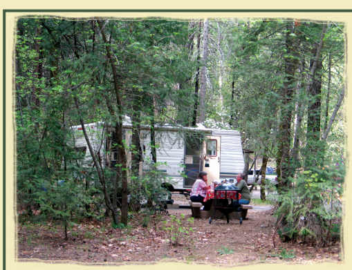
Potato Patch Campground

Battle Creek Campground (Forest Service) 50 campsites, potable water www.fs.fed.us/r5/lassen/ (530) 258-2141