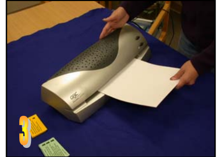
3 Insert the lamination sleeve into the pre-heated lamination machine, flap-side first.