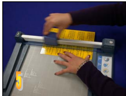
5 Align the crosses on the wallet card sheets with the cutting guide on the paper trimmer.