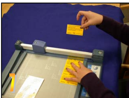
7 The finished wallet card size is 2” x 3.5”.