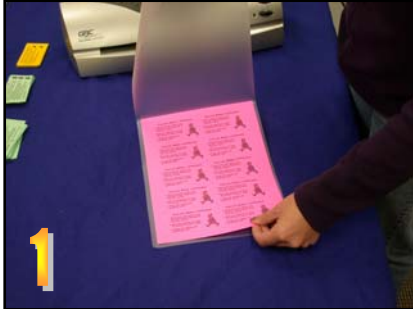
1 Place the double-sided sheet of wallet cards in the lamination pouch.

We’ve found that using brightly colored paper makes the wallet cards more visually appealing and allows patients to easily distinguish them from one another.