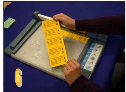
6 You will receive more uniform results if you first cut the cards vertically and then horizontally.