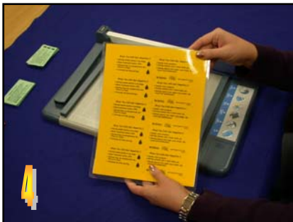
4 Remove the laminated sheet from the cardboard sleeve and allow to cool.