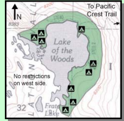
Lake of the Woods

Specific campsites have been designated within 500 feet of Eagle, Grouse and Hemlock lakes, and the north and east side of Lake of the Woods. Designated campsites are marked with a 4 x 4 post with a tent symbol, and are first-come, first-served only. If all designated campsites are taken when you arrive, you must camp more than 500 feet from the lakeshore.