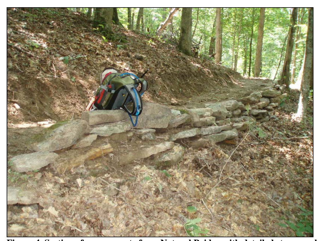
Figure 4. Section of new re-route from Natural Bridge with detailed stone work.