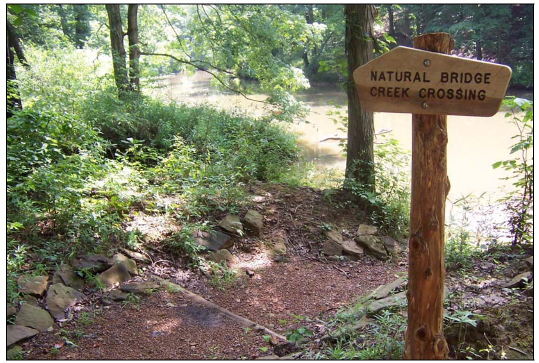
Figure 5. New sign at Natural Bridge Creek Crossing.