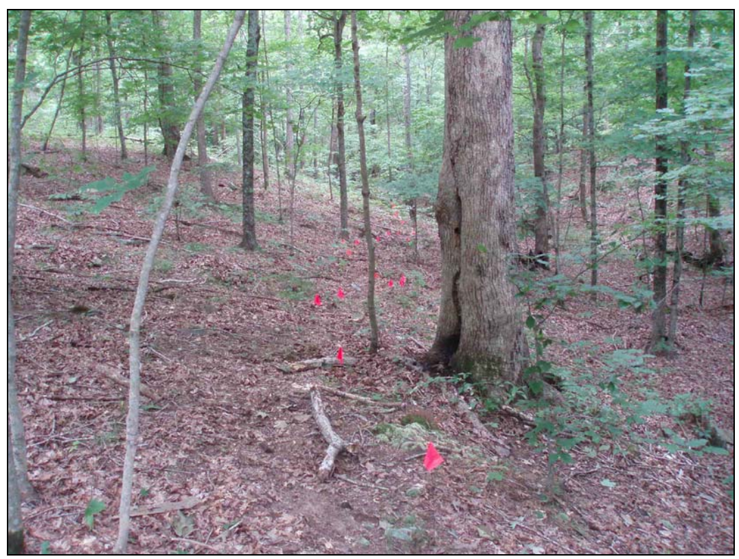
Figure 1. Pin flags used to lay out the re-route of trail into Secret Canyon.