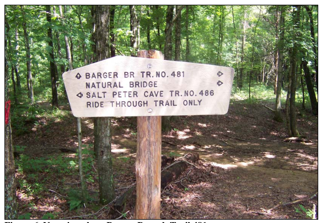
Figure 6. New sign along Barger Branch Trail 481.