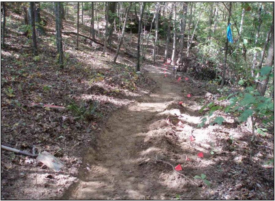
Figure 1. Section of re-route under construction near Natural Bridge.