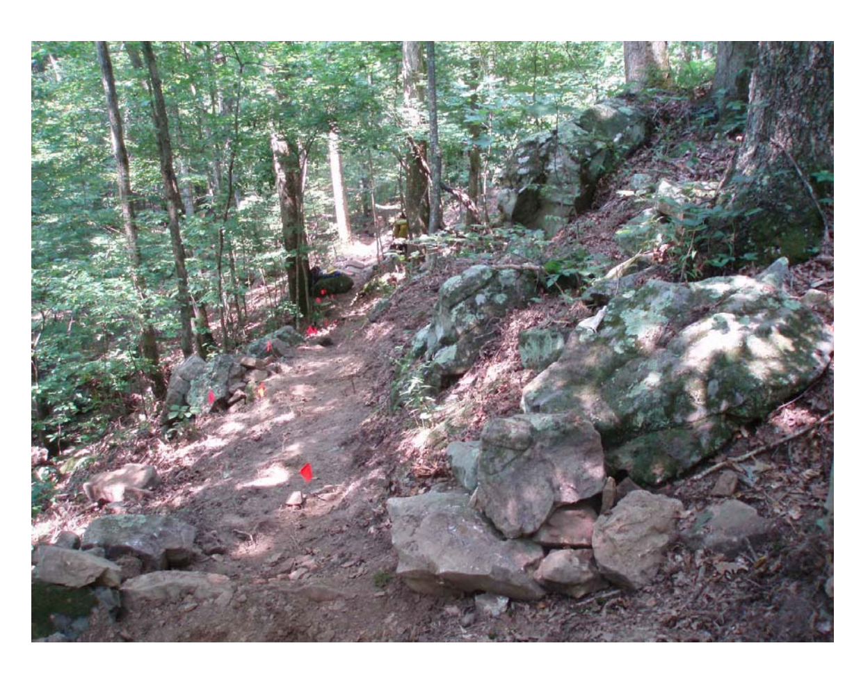
Side hill construction – early phase