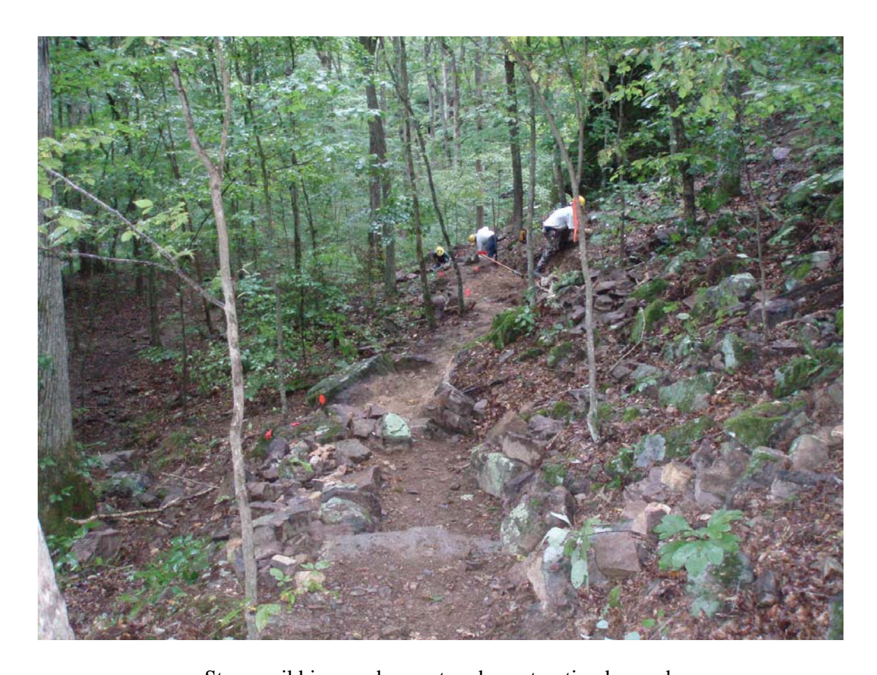
Steps, cribbing, and more tread construction beyond.