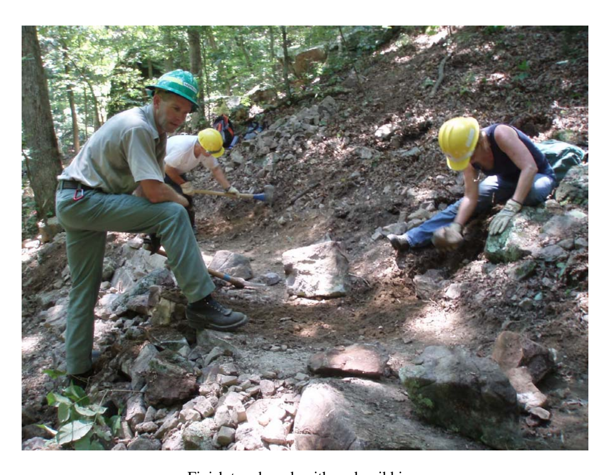
Finish tread work with rock cribbing.