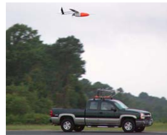
Aerosonde vehicle.

During the 2007 Hurricane Season, AOML, and NASA successfully flew an Aerosonde ® Unmanned Aircraft System (UAS) through hurricane-force winds and at record low altitudes into Tropical Cyclone Noel. The use of UAS to monitor tropical storms and hurricanes is important because UAS thermodynamic and wind observations can be obtained at altitudes unsafe for manned aircraft and in very high spatial resolution making these unique data highly desirable.