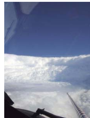
Eyewall Hurricane Katrina, August 28, 2005

Hurricane Formation: OAR scientists are learning more about hurricane formation each year. They investigate how Saharan dust storms affect hurricane development and intensity change; how tropical disturbances develop into hurricanes; and the structure and evolution of hurricanes that make landfall and eventually decay over land.