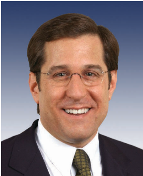
Steven R. Rothman of Fair Lawn (9th District) Democrat—5th term