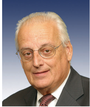
Bill Pascrell, Jr. of Paterson (8th District) Democrat—5th term