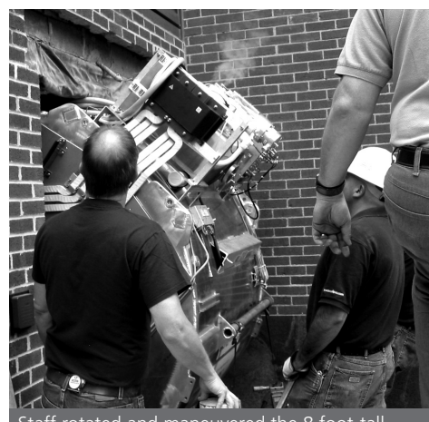
MRIs through the CC's 7 foot-tall doors and

Although 39 parking spaces will be permanently removed on P1 as a result of the project, patients will always be able to find a space to park with the assistance of attendants.