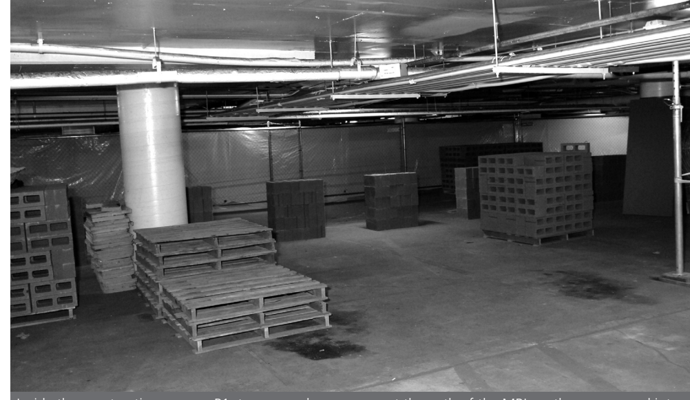
Inside the construction area on P1, temporary beams support the path of the MRIs as they are moved into their new positions on the unit above them. Workers are building a cinder block wall to contain the magnetic field of the MRI suite.