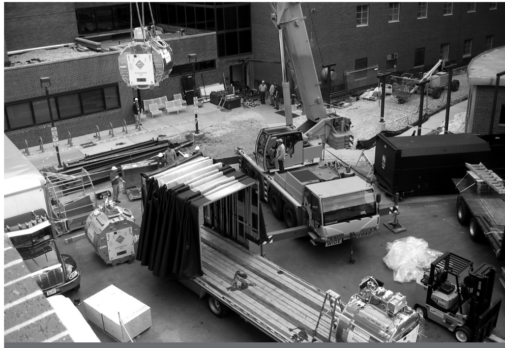
The delivery of three MRIs in one day set a record for the machines' manufacturer and created a logistical ballet around the CC

The P1 construction work, which began in April, temporarily blocks 54 park-