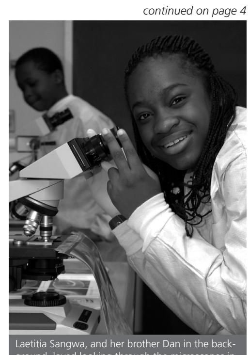
ground, loved looking through the microscopes in the CC's Department of Laboratory Medicine.