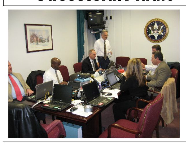
Audit team with their daily briefing

The United States Marshals Service, Office of Compliance Review, conducted an audit of the District of Delaware in November 2007. It had been ten years since the last similar review. The week long inspection from the ten person review team consisted operational and administrative employees from around the country. The mission of the compliance review is to ensure conformity with applicable laws and policies.