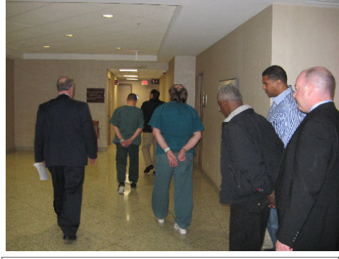
Federal prisoners being escorted to court

combat the use of guns in the City of Wilmington. program started February 2007. All felons in possession of firearms arrested Wilmington bv Police Officers were immediately transferred