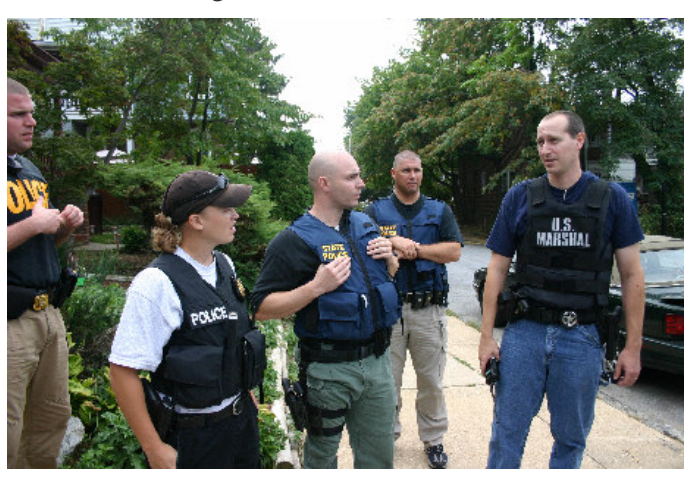
State and New Castle County Police team up with Marshals to try and apprehend Sex-Offenders in Delaware.

register so as to not duplicate the efforts of state and local police. It is a very arduous task trying to find these pedophiles." The Marshals are working closely with the National Center for Missing and Exploited Children and the Sex Offenders Registration Unit in Delaware.