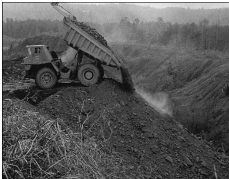
◀ Dumping overburden

Between January 1990 and July 1996, 136 trucks and other haulage vehicles overturned while dumping material at edges of dump locations. This type of accident occurred more frequently than any other. Twenty-five (25) fatalities were reported while trucks or other haulage equipment, such as front-end-loaders, were backing up or end-dumping at edges of elevated dump locations. Typically these locations were excess mine spoil fills, waste rock dumps, ore stockpiles, processed mine wastes, or valley fills. Most frequently, the haulage vehicle backed onto unstable fill material that gave way, or backed through a perimeter berm, causing the vehicle to topple backward down the slope or onto its side.