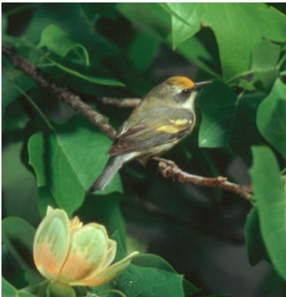
The Golden-winged Warbler breeds in Ontario and the northern United States and overwinters in Central America and northern South America. It is among a suite of early successional forest species that have shown some of the greatest declines of any landbird habitat group.

duck-hunting trip to enjoying a chickadee at a backyard feeder to watching a pair of red-tailed hawks from a tractor seat. In addition, more than 13,000 subsistence hunters have a long and rich cultural tradition of harvesting birds in rural Alaska. These citizens have every expectation that their children, grandchildren, and great-grandchildren will be able to experience the same wonder and enjoyment of birds in their natural habitats. The Service recognizes that migratory bird conservation and management is ultimately for the benefit of future generations of birds and people, too.