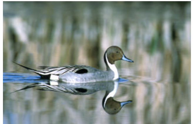
Experiencing long-term population declines, the Northern Pintail breeds throughout most of Alaska and Canada southward into the mid-western United States. It over-winters throughout most of the United States south through Mexico to northern South America.