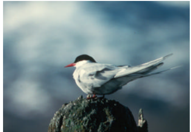
The Arctic tern flies over 20,000 miles (35,000 km) every year – roughly the circumference of the Earth – from its arctic tundra breeding grounds via the coast of Africa to Antarctica and back again. It is declining at the southern edge of its breeding range on the Atlantic Coast.