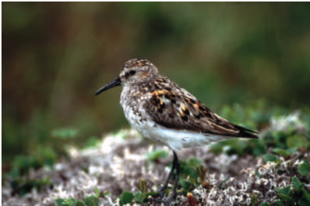
From Alaskan and eastern Siberian breeding grounds, the Western Sandpiper migrates southeast to wintering areas on both coasts of North and South America. Like many shorebird species, it remains vulnerable because of declining numbers and dependence on a relatively few critical stopover sites, such as the Copper River Delta in Alaska.

management context will enable the Service and its partners to make more cost-effective policy, management, and regulatory decisions that meet migratory bird conservation goals and objectives at continental, national, and landscape scales.