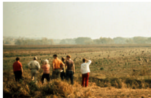
U.S. Fish and Wildlife Service

E-7: Maintain and expand existing conservation partnerships with hunters and the hunting industry to increase awareness of hunting opportunities and the importance of bird conservation.