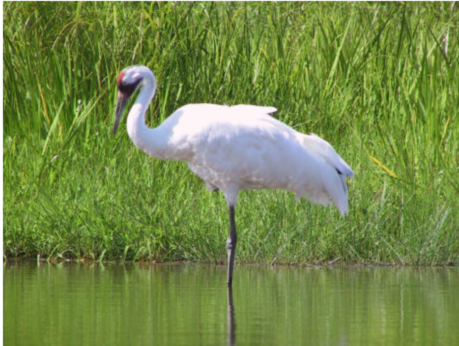
Though absent from much of its historic range, the Whooping Crane has been brought back from the brink of extinction through decades of research and management.