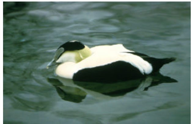
Breeding from Maine north to the arctic, the Common Eider, like other sea ducks, is one of the least well-studied species of waterfowl. It is particularly vulnerable to oil spills because it congregates in large, dense, flocks during winter, molting, and migration.