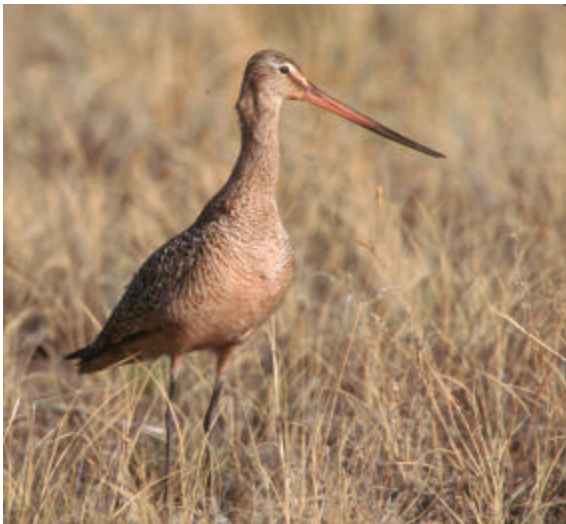
The Marbled Godwit breeds primarily in the grasslands of the northern Great Plains and winters in large numbers along the coast of southern California and western Mexico. It is one of many grassland breeders threatened by habitat degradation.

The U.S. Fish and Wildlife Service's mission is, working with others, to conserve, protect and enhance fish, wildlife, and plants and their habitats for the continuing benefit of the American people.