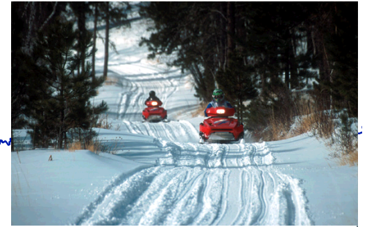
Think SNOW and enjoy your National Forest