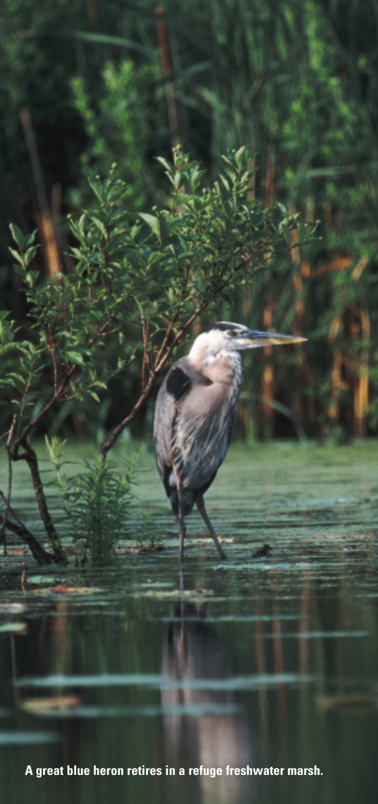
A great blue heron retires in a refuge freshwater marsh.