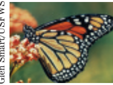
The monarch is among the many butterfly species that occur on the refuge.

In September, great numbers of migrating monarch butterflies often pause to drink nectar on seaside goldenrod and other wildflowers in bloom. Also at this time shorebird diversity is at its height. Peregrine falcons occur most regularly from mid-September through November. Waterfowl numbers peak in October and November with many species present. Alfalfa, cabbage, and clouded sulphur butterflies most commonly linger into November.