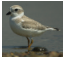
Unspoiled scenery adds to the pleasure of a refuge visit.