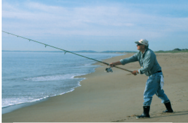
An early morning fisherman casts a line from the refuge beach in hopes of landing a "striper."