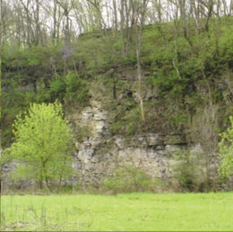
Algific slope on the refuge, USFWS