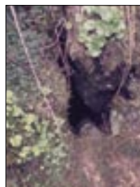
Cold air vent on algific slope, with golden saxifrage

In the summer, air is drawn down through sinkholes, flows over frozen groundwater and is released out vents on the slopes. Summer temperatures on the slopes range from just above freezing to 55°F. In winter, the air is drawn into the vents, and the groundwater again freezes.