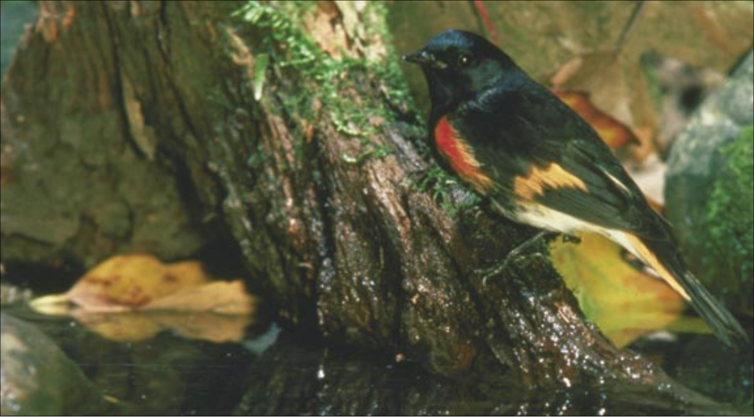
American Redstart