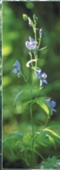
Northern monkshood, Bob Clearwater