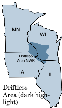
Driftless Area (dark highlight)